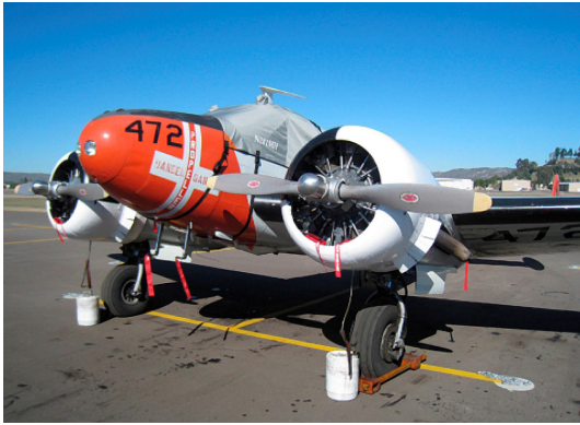
Beech 18 Cockpit Cover and Carb Air Inlet Plugs

This cover type is made from Silver Acrylic Sunbrella canvas and is 100% lined with a soft and smooth microfiber. Bruce's Custom Covers developed this material combination especially for aircraft protection. The outer material is medium weight and treated for water resistance, UV resistance and anti-static buildup. The inner lining is a very soft and smooth microfiber to prevent scratching. The material is very reflective, and tests show that the cabin interior temperature can be reduced to near-ambient temperature on the hottest of days. It is water, ice and snow repellent, yet breathable to allow moisture to escape from between the cover and the aircraft surface.