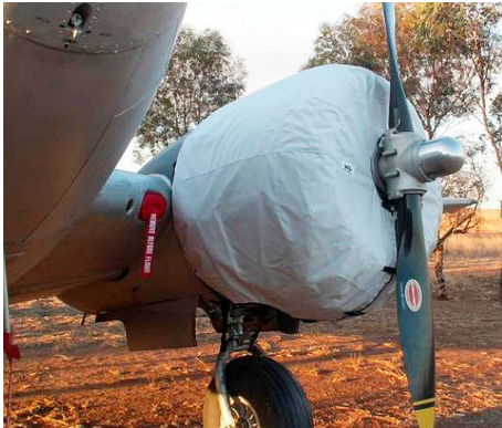
Beech D-18 Engine Covers, Center Section Oil Cooler Inlet Plugs, and Pitot Covers

This cover type is made from Silver Acrylic Sunbrella canvas and is 100% lined with a soft and smooth microfiber. Bruce's Custom Covers developed this material combination especially for aircraft protection. The outer material is medium weight and treated for water resistance, UV resistance and anti-static buildup. The inner lining is a very soft and smooth microfiber to prevent scratching. The material is very reflective, and tests show that the cabin interior temperature can be reduced to near-ambient temperature on the hottest of days. It is water, ice and snow repellent, yet breathable to allow moisture to escape from between the cover and the aircraft surface.