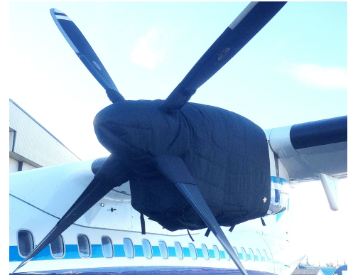
ATR-72-202 Insulated Engine & Prop Hub Covers