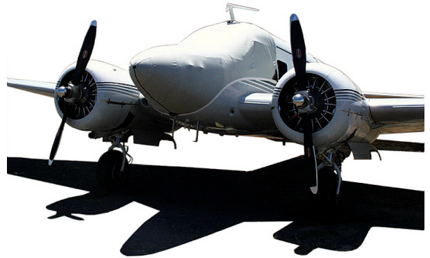
Beech 18 Cockpit/Nose Cover