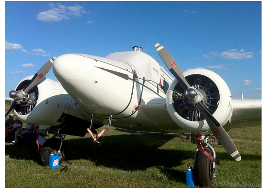
Beech 18 Cockpit Cover & Carb Inlet Plugs