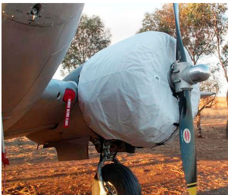
Beech D-18 Engine Covers, Center Section Oil Cooler Inlet Plugs, and Pitot Covers