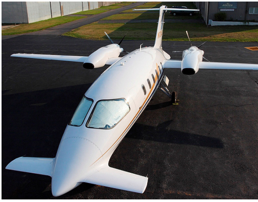
Piaggio 180 Cockpit HeatShields