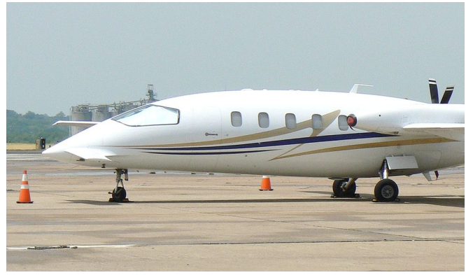
Piaggio Avanti P180 Cockpit Heatshields