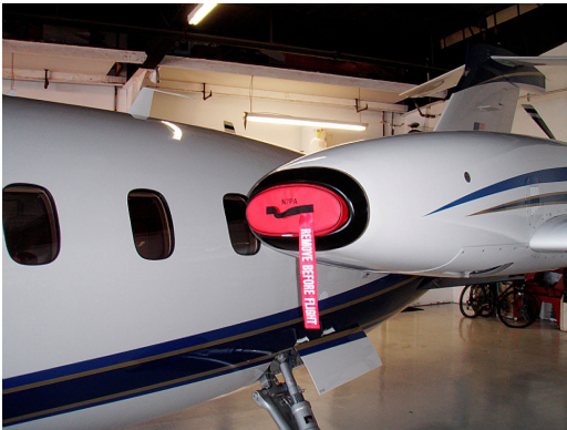
Piaggio 180 Engine Inlet Plugs

Engine Inlet Plugs are custom fit for your Piaggio Avanti P180 intakes, made with heavy-duty vinyl material, and stuffed with a single block of sculpted urethane foam. Each plug has a zipper that allows the foam to be removed and dried if necessary. Engine plugs have warning flags that are visible from the cockpit or 'remove before flight' streamers sewn onto the face of the plugs. Most plugs are imprinted with the aircraft registration number in black for an extra charge. Storage bag NOT included. Engine plugs may be inserted after flight when the engine is still warm. Engine Inlet Plugs are commonly referred to as Cowl Plugs, Intake Plugs, Cowl Blocks, Engine Blocks, and Engine Bungs.