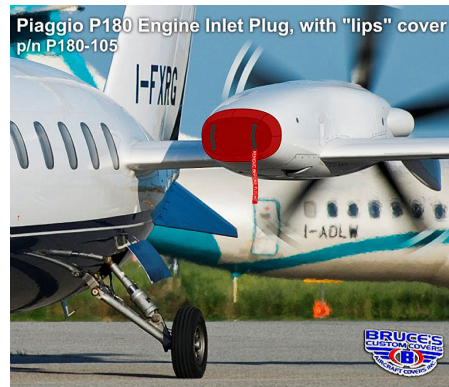
Piaggio 180 Engine Inlet Plugs with extension to cover "lips"