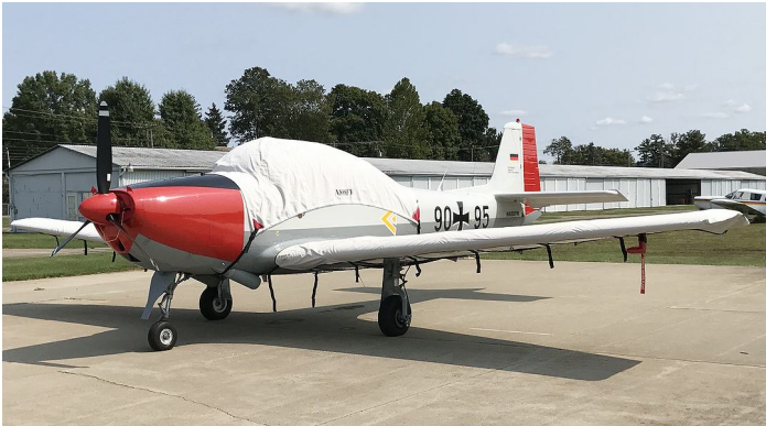
Focke Wulf F149 Canopy Cover, Wing Covers, Engine Plugs

Cover and Engine Cover. This cover will enclose the engine cowl and will extend aft to cover all of the windows. This cover type is made from Silver Acrylic Sunbrella canvas and is 100% lined with a soft and smooth microfiber. Bruce's Custom Covers developed this material combination especially for aircraft protection. The outer material is medium weight and treated for water resistance, UV resistance and anti-static buildup. The inner lining is a very soft and smooth microfiber to prevent scratching. The material is very reflective, and tests show that the cabin interior temperature can be reduced to near-ambient temperature on the hottest of days. It is water, ice and snow repellent, yet breathable to allow moisture to escape from between the cover and the aircraft surface.