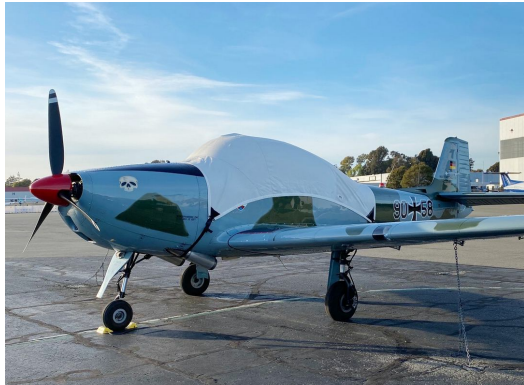
Focke Wulf 149 Trainer Canopy Cover

Cover and Engine Cover. This cover will enclose the engine cowl and will extend aft to cover all of the windows. This cover type is made from Silver Acrylic Sunbrella canvas and is 100% lined with a soft and smooth microfiber. Bruce's Custom Covers developed this material combination especially for aircraft protection. The outer material is medium weight and treated for water resistance, UV resistance and anti-static buildup. The inner lining is a very soft and smooth microfiber to prevent scratching. The material is very reflective, and tests show that the cabin interior temperature can be reduced to near-ambient temperature on the hottest of days. It is water, ice and snow repellent, yet breathable to allow moisture to escape from between the cover and the aircraft surface.