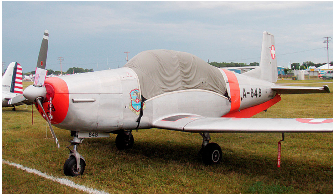
Piaggio P-149D Trainer Canopy Cover