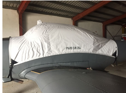
Piaggio P149D Canopy Cover