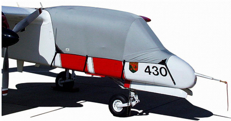
Rockwell OV-10 Canopy Cover