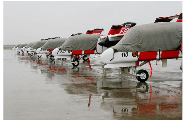
Rockwell OV-10 Canopy Covers