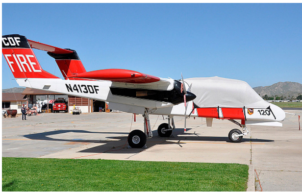
Rockwell OV-10 Canopy Cover