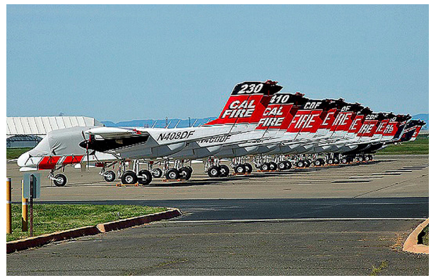
Rockwell OV-10 Canopy Covers