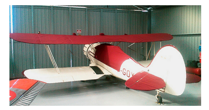
Waco UPF-7 Upper Wing Cover, Horizontal Stabilizer Cover & Canopy Cover

WINTER USE MATERIAL - Made with Solution-Dyed Polyester fabric, this option is intended for seasonal use to aid in deicing, rain mitigation, or for occasional travel. The material is lighter and more compact, but more susceptible to UV damage and may have a shorter useful life if used continuously outside than the all-year use material.