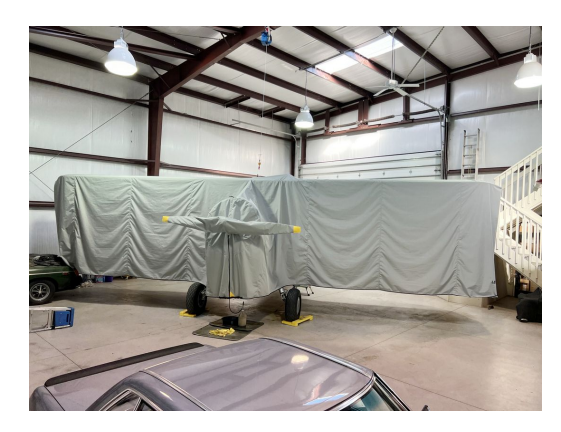
Stearman PT-13 Full Body Dust Cover

Some high value aircraft end up logging lots of hangar time, and become dust magnets in the process. A high quality, well fitting dust cover provides easy assurance that the aircraft's surfaces remain clean and free of grit and grime. Available in a large variety of colors, each dust cover is custom made according to aircraft details and customer preferences. Fire retardant fabrics are also available.