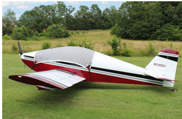
OneX Canopy Cover