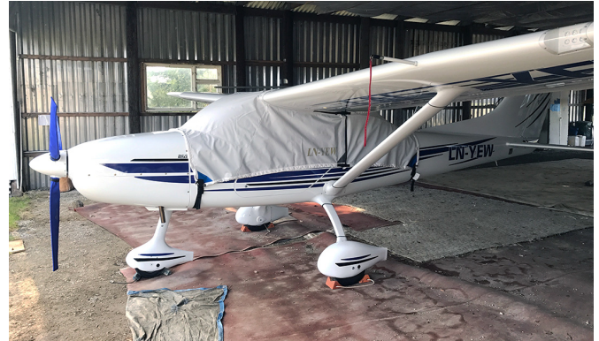
TL Ultralight Sirius TL-3000 Canopy Cover (Over-The-Top Style) TL Ultralight Sirius TL-3000 Canopy Cover (Over-The-Top Style)