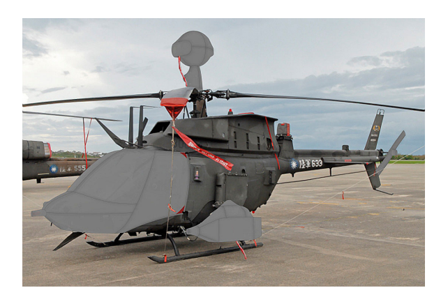
Windshield/Nose, Mast Antenna, 50 Cal, ALQ & Tail Rotor Covers