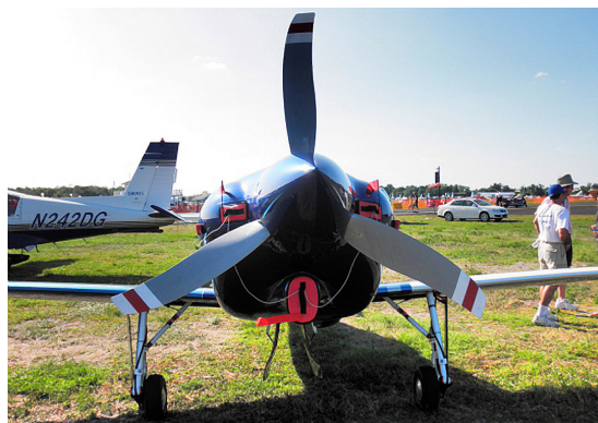
Nemesis NXT Engine Inlet Plug set