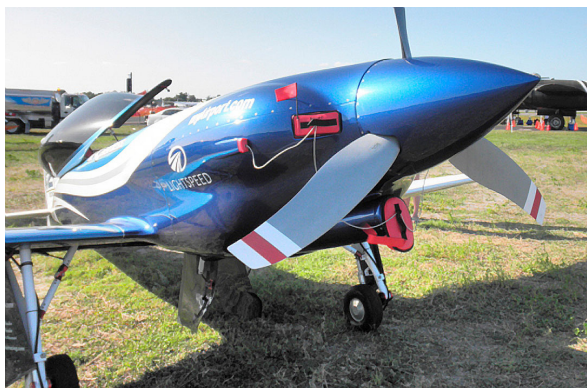
Nemesis NXT Engine Inlet Plug set

Engine Inlet Plugs are custom fit for your Nemesis NXT intakes, made with heavy-duty vinyl material, and stuffed with a single block of sculpted urethane foam. Each plug has a zipper that allows the foam to be removed and dried if necessary. Engine plugs have warning flags that are visible from the cockpit or 'remove before flight' streamers sewn onto the face of the plugs. Most plugs are imprinted with the aircraft registration number in black for an extra charge. Storage bag NOT included. Engine plugs may be inserted after flight when the engine is still warm. Engine Inlet Plugs are commonly referred to as Cowl Plugs, Intake Plugs, Cowl Blocks, Engine Blocks, and Engine Bungs.