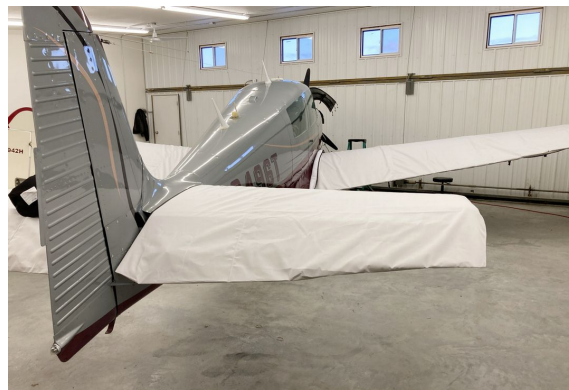
Navion Rangemaster Wing & Horizontal Stabilizer Covers