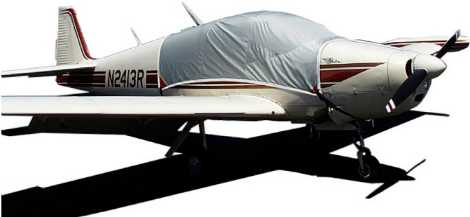
Covers & Plugs for the Navion Rangemaster