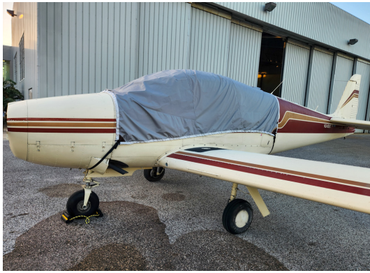
Navion Rangemaster Travel Cover, Light Weight Canopy Cover, (Super Slope windshield)