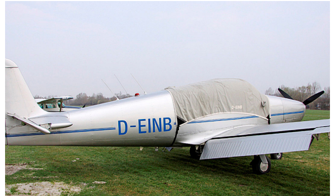
Navion Rangemaster Canopy Cover