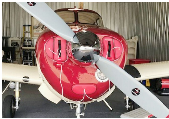
Ryan Navion B Engine Inlet Plugs