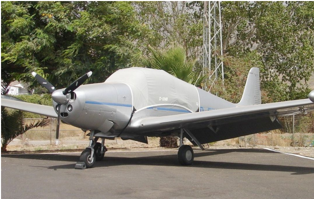
Navion Rangemaster Canopy Cover

This cover type is made from Silver Acrylic Sunbrella canvas and is 100% lined with a soft and smooth microfiber. Bruce's Custom Covers developed this material combination especially for aircraft protection. The outer material is medium weight and treated for water resistance, UV resistance and anti-static buildup. The inner lining is a very soft and smooth microfiber to prevent scratching. The material is very reflective, and tests show that the cabin interior temperature can be reduced to near-ambient temperature on the hottest of days. It is water, ice and snow repellent, yet breathable to allow moisture to escape from between the cover and the aircraft surface.