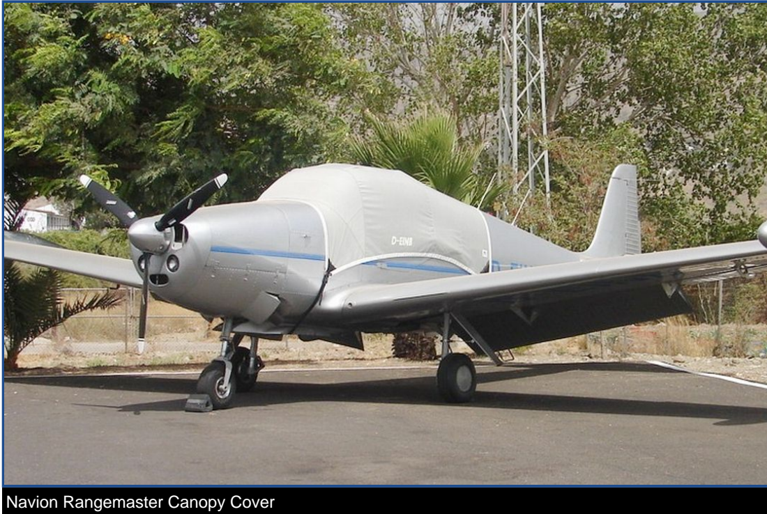
Navion Rangemaster Canopy Cover