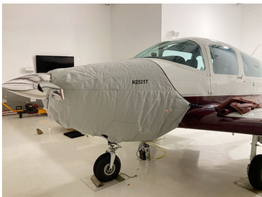
NAVION H Insulated Engine Cover

This cover type is made from Silver Acrylic Sunbrella canvas and is 100% lined with a soft and smooth microfiber. Bruce's Custom Covers developed this material combination especially for aircraft protection. The outer material is medium weight and treated for water resistance, UV resistance and anti-static buildup. The inner lining is a very soft and smooth microfiber to prevent scratching. The material is very reflective, and tests show that the cabin interior temperature can be reduced to near-ambient temperature on the hottest of days. It is water, ice and snow repellent, yet breathable to allow moisture to escape from between the cover and the aircraft surface.