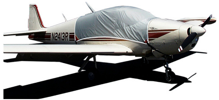
Covers & Plugs for the Navion Rangemaster