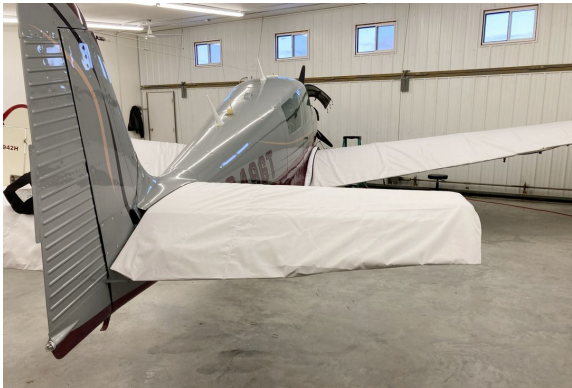
Navion Rangemaster Wing & Horizontal Stabilizer Covers