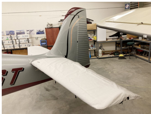
Navion Rangemaster Horizontal Stabilizer Covers

mitigation, or for occasional travel. The material is lighter and more compact, but more susceptible to UV damage and may have a shorter useful life if used continuously outside than the all-year use material.