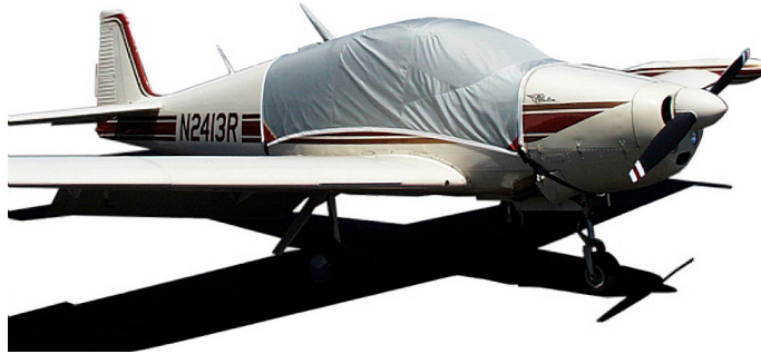
Covers & Plugs for the Navion Rangemaster

This cover type is made from Silver Acrylic Sunbrella canvas and is 100% lined with a soft and smooth microfiber. Bruce's Custom Covers developed this material combination especially for aircraft protection. The outer material is medium weight and treated for water resistance, UV resistance and anti-static buildup. The inner lining is a very soft and smooth microfiber to prevent scratching. The material is very reflective, and tests show that the cabin interior temperature can be reduced to near-ambient temperature on the hottest of days. It is water, ice and snow repellent, yet breathable to allow moisture to escape from between the cover and the aircraft surface.