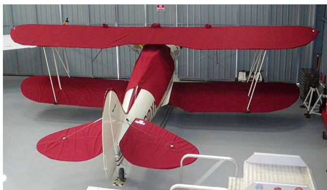
Waco UPF-7 Upper/Lower Wing Cover, Horizontal Stabilizer Cover, & Canopy Cover

WINTER USE MATERIAL - Made with Solution-Dyed Polyester fabric, this option is intended for seasonal use to aid in deicing, rain mitigation, or for occasional travel. The material is lighter and more compact, but more susceptible to UV damage and may have a shorter useful life if used continuously outside than the all-year use material.