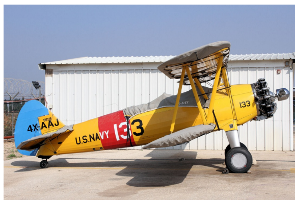
Boeing Stearman PT-13 Canopy, Wing & Horiz. Stab Covers