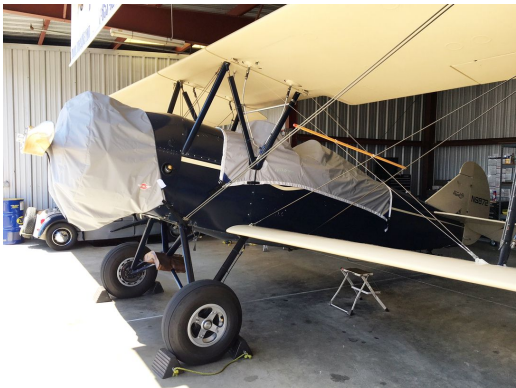
Boeing Stearman PT-13 Canopy, Wing & Horiz. Stab Covers Travel Air 4000 Canopy and Engine Covers, light weight travel type