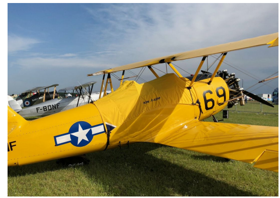
Travel Air 4000 Canopy and Engine Covers, light weight travel type