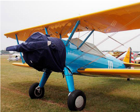
Stearman Engine Cover