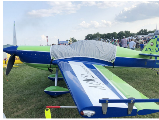
MX2 Lightweight Travel Canopy Cover