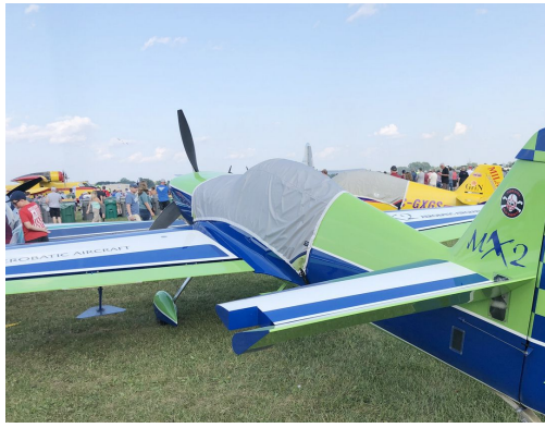
MX2 Lightweight Travel Canopy Cover