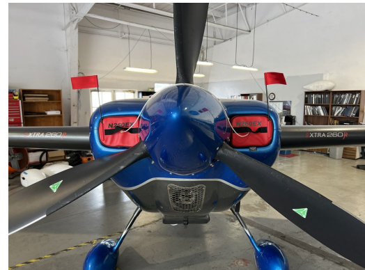
Extra 260 Engine Inlet Plugs