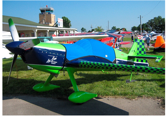
MX-2 Canopy Cover