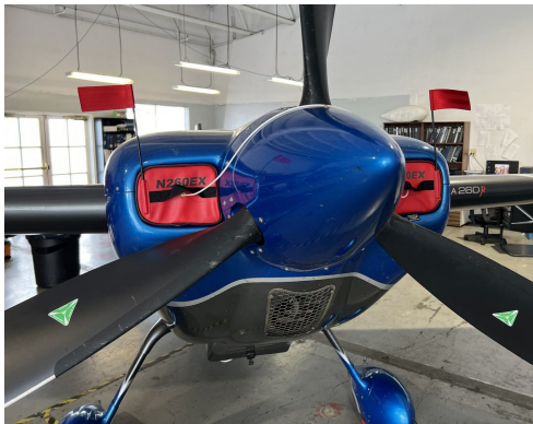
Extra 260 Engine Inlet Plugs

Engine Inlet Plugs are custom fit for your MXR Technologies MXS & MX2 intakes, made with heavy-duty vinyl material, and stuffed with a single block of sculpted urethane foam. Each plug has a zipper that allows the foam to be removed and dried if necessary. Engine plugs have warning flags that are visible from the cockpit or 'remove before flight' streamers sewn onto the face of the plugs. Most plugs are imprinted with the aircraft registration number in black for an extra charge. Storage bag NOT included. Engine plugs may be inserted after flight when the engine is still warm. Engine Inlet Plugs are commonly referred to as Cowl Plugs, Intake Plugs, Cowl Blocks, Engine Blocks, and Engine Bungs.