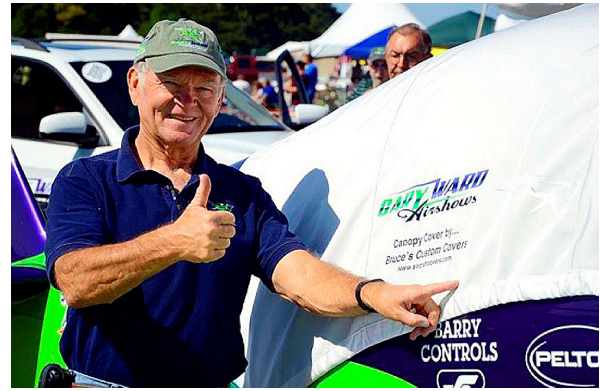
MX-2 Canopy Cover