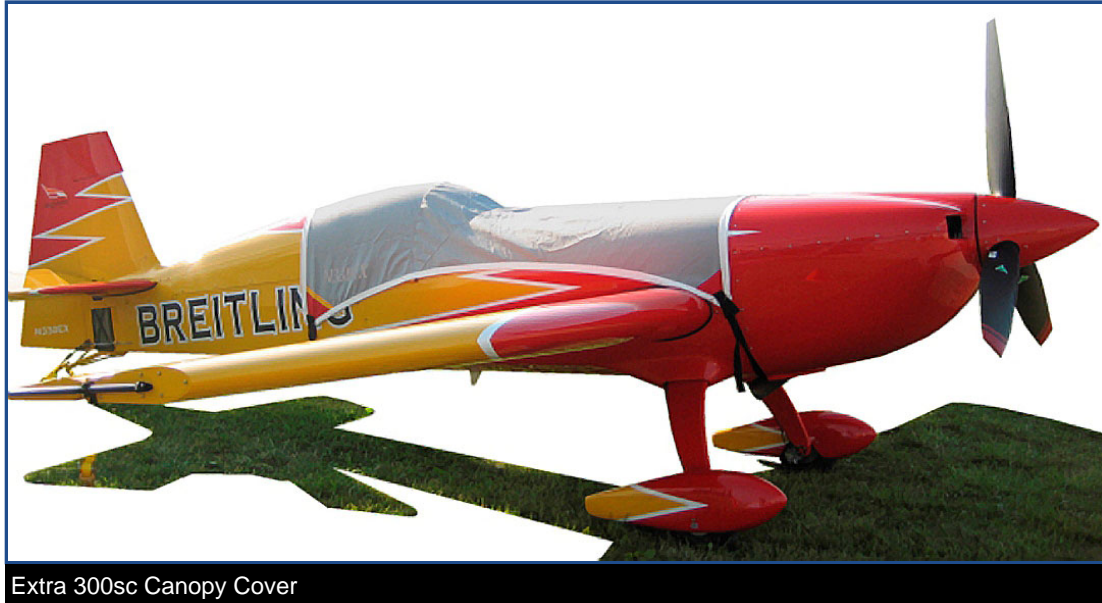
Extra 300sc Canopy Cover