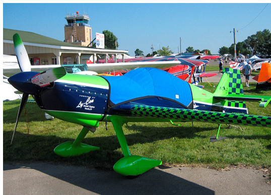
MX-2 Canopy Cover