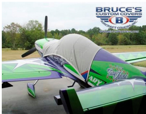
MX-2 Canopy Cover