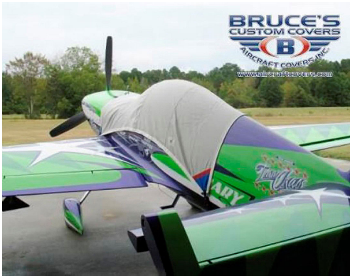
MX-2 Canopy Cover