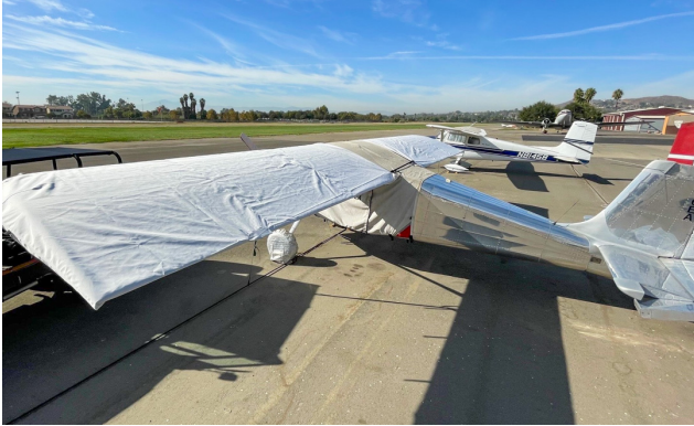
Murphy Elite Wing Covers

WINTER USE MATERIAL - Made with Solution-Dyed Polyester fabric, this option is intended for seasonal use to aid in deicing, rain mitigation, or for occasional travel. The material is lighter and more compact, but more susceptible to UV damage and may have a shorter useful life if used continuously outside than the all-year use material.