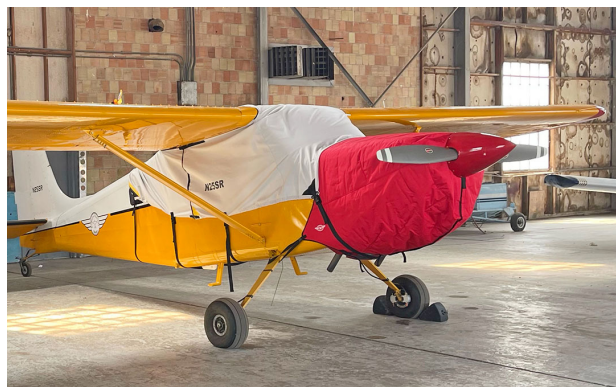
Murphy Super Rebel Insulated Engine Cover