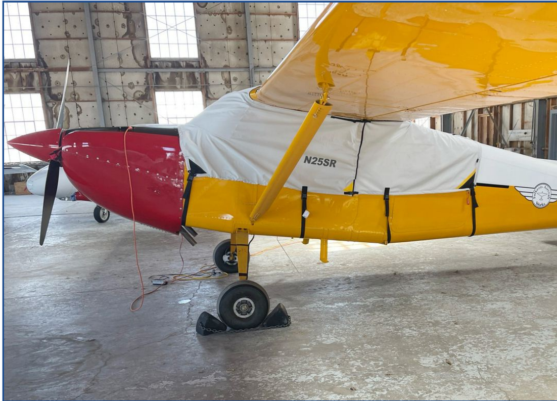
Murphy Super Rebel Canopy Cover