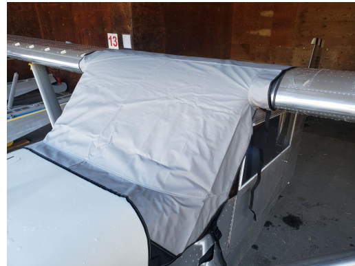
Murphy Elite Extended Canopy Cover, 3D Model Murphy Rebel, Moose, Renegade, Spirit, Elite, etc. Windshield/Skylight Cover