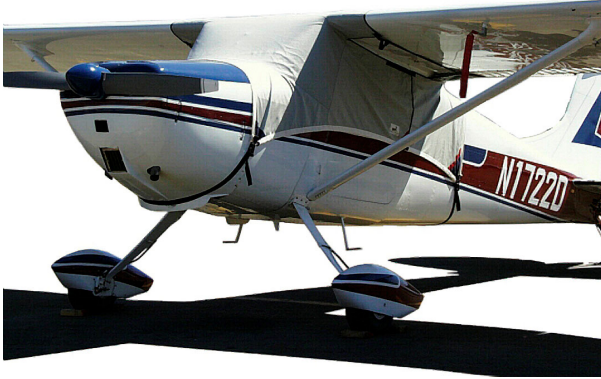
Over-the-Top Canopy Cover

This cover type is made from Silver Acrylic Sunbrella canvas and is 100% lined with a soft and smooth microfiber. Bruce's Custom Covers developed this material combination especially for aircraft protection. The outer material is medium weight and treated for water resistance, UV resistance and anti-static buildup. The inner lining is a very soft and smooth microfiber to prevent scratching. The material is very reflective, and tests show that the cabin interior temperature can be reduced to near-ambient temperature on the hottest of days. It is water, ice and snow repellent, yet breathable to allow moisture to escape from between the cover and the aircraft surface.