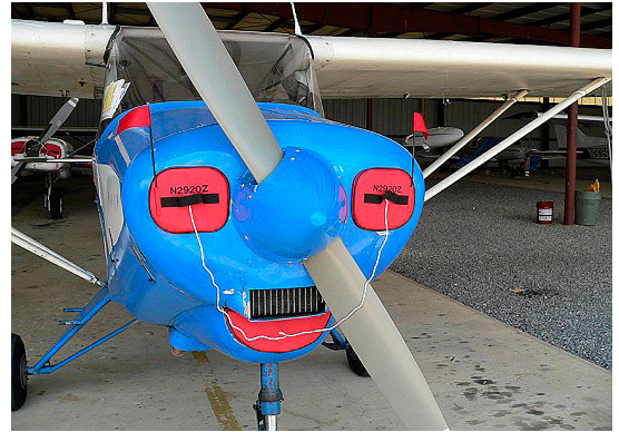
Piper PA-22-150 Engine Inlet Plugs (set of 3)