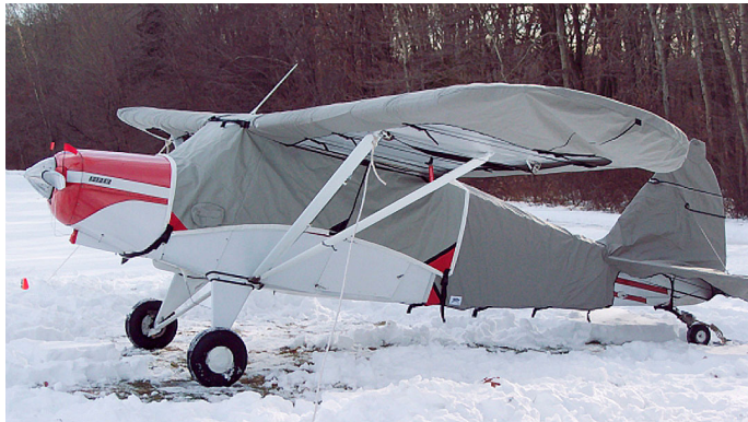
Piper Clipper Canopy Cover, Empennage & Wing Covers, Engine Plugs

WINTER USE MATERIAL - Made with Solution-Dyed Polyester fabric, this option is intended for seasonal use to aid in deicing, rain mitigation, or for occasional travel. The material is lighter and more compact, but more susceptible to UV damage and may have a shorter useful life if used continuously outside than the all-year use material.