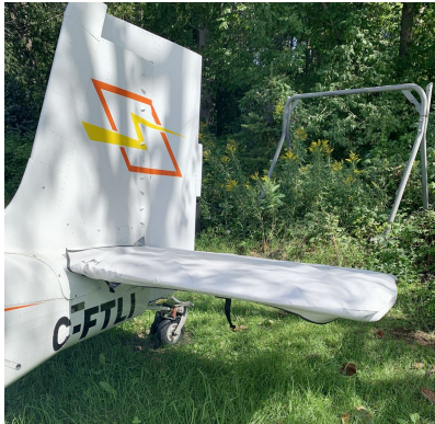
Murphy Elite Horizontal Stabilizer Covers

WINTER USE MATERIAL - Made with Solution-Dyed Polyester fabric, this option is intended for seasonal use to aid in deicing, rain mitigation, or for occasional travel. The material is lighter and more compact, but more susceptible to UV damage and may have a shorter useful life if used continuously outside than the all-year use material.