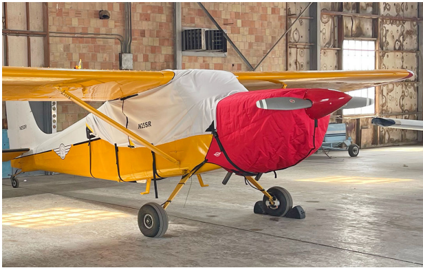
Murphy Super Rebel Insulated Engine Cover

This cover type is made from Silver Acrylic Sunbrella canvas and is 100% lined with a soft and smooth microfiber. Bruce's Custom Covers developed this material combination especially for aircraft protection. The outer material is medium weight and treated for water resistance, UV resistance and anti-static buildup. The inner lining is a very soft and smooth microfiber to prevent scratching. The material is very reflective, and tests show that the cabin interior temperature can be reduced to near-ambient temperature on the hottest of days. It is water, ice and snow repellent, yet breathable to allow moisture to escape from between the cover and the aircraft surface.