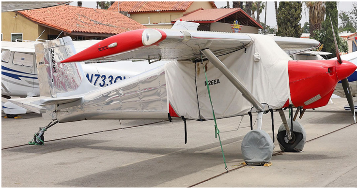
Murphy Elite Extended Canopy Cover

This cover type is made from Silver Acrylic Sunbrella canvas and is 100% lined with a soft and smooth microfiber. Bruce's Custom Covers developed this material combination especially for aircraft protection. The outer material is medium weight and treated for water resistance, UV resistance and anti-static buildup. The inner lining is a very soft and smooth microfiber to prevent scratching. The material is very reflective, and tests show that the cabin interior temperature can be reduced to near-ambient temperature on the hottest of days. It is water, ice and snow repellent, yet breathable to allow moisture to escape from between the cover and the aircraft surface.