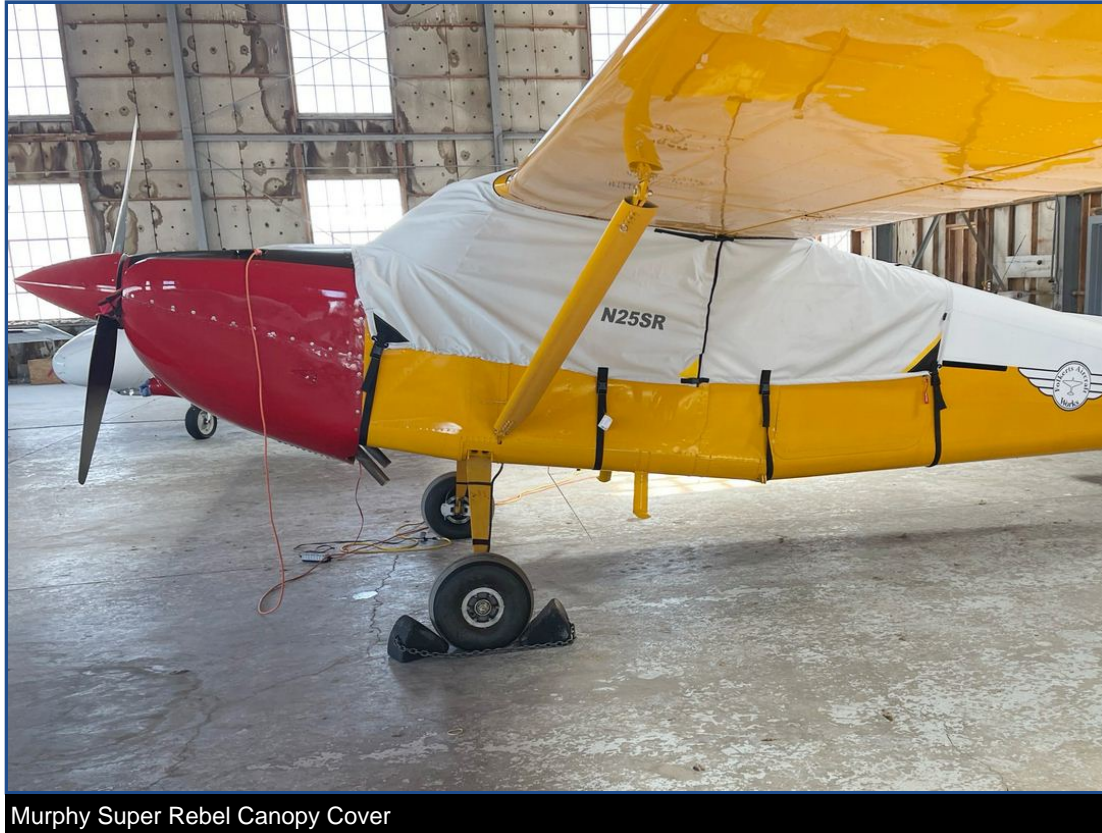
Murphy Super Rebel Canopy Cover