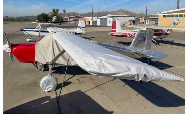
Murphy Elite Wing Covers