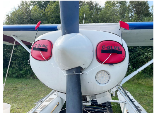
Murphy Rebel Engine Inlet Plugs