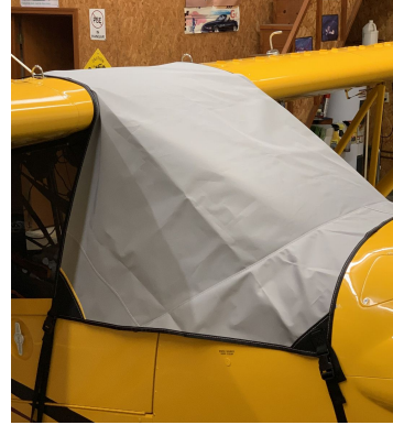
Cub Crafters Carbon Cub FX3 Windshield/Skylight Cover, travel weight