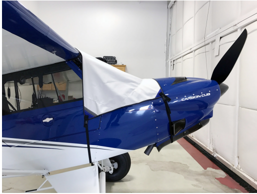
Cub Crafters CC-11 Windshield Cover

Covers developed this material combination especially for aircraft protection. The outer material is medium weight and treated for water resistance, UV resistance and anti-static buildup. The inner lining is a very soft and smooth microfiber to prevent scratching. The material is very reflective, and tests show that the cabin interior temperature can be reduced to near-ambient temperature on the hottest of days. It is water, ice and snow repellent, yet breathable to allow moisture to escape from between the cover and the aircraft surface.