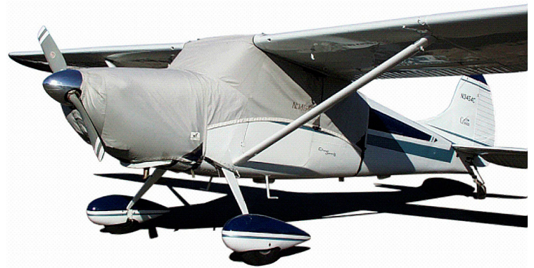
Cessna 170 Canopy Cover & Engine Cover