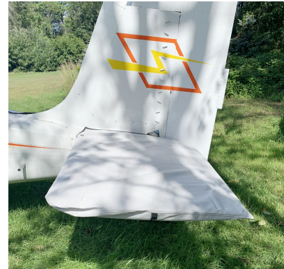
Murphy Elite Horizontal Stabilizer Covers