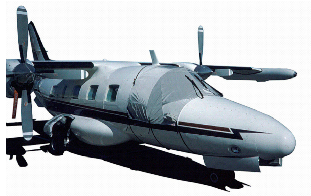
MU-2 Windshield Cover & Engine Plugs