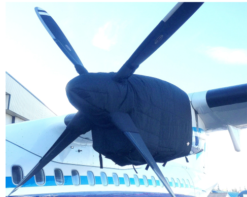
ATR-72-202 Insulated Engine & Prop Hub Covers