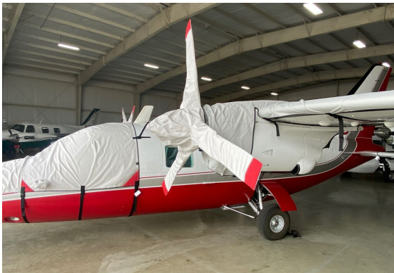
MU-2 Cockpit/Nose, Wing/Engine & Prop Covers

This cover type is made from Silver Acrylic Sunbrella canvas and is 100% lined with a soft and smooth microfiber. Bruce's Custom Covers developed this material combination especially for aircraft protection. The outer material is medium weight and treated for water resistance, UV resistance and anti-static buildup. The inner lining is a very soft and smooth microfiber to prevent scratching. The material is very reflective, and tests show that the cabin interior temperature can be reduced to near-ambient temperature on the hottest of days. It is water, ice and snow repellent, yet breathable to allow moisture to escape from between the cover and the aircraft surface.