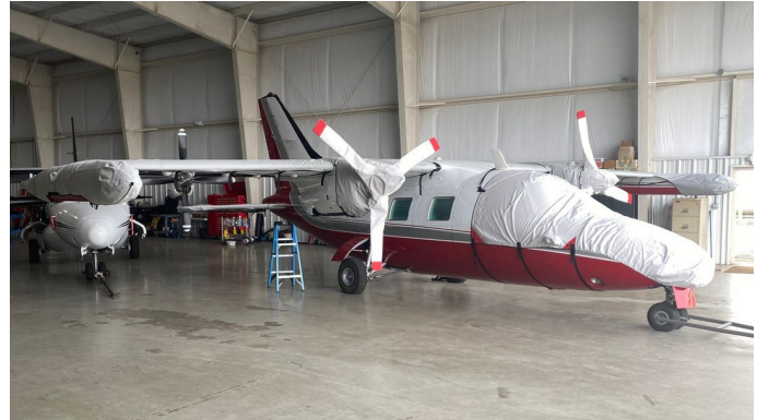
MU-2 Cockpit/Nose, Wing/Engine & Prop Covers