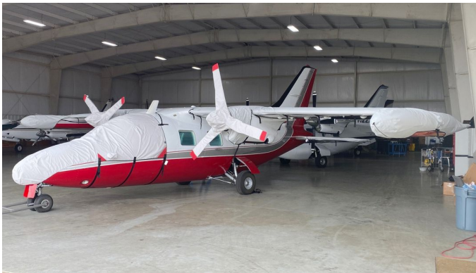
MU-2 Cockpit/Nose, Wing/Engine & Prop Covers

This cover type is made from Silver Acrylic Sunbrella canvas and is 100% lined with a soft and smooth microfiber. Bruce's Custom Covers developed this material combination especially for aircraft protection. The outer material is medium weight and treated for water resistance, UV resistance and anti-static buildup. The inner lining is a very soft and smooth microfiber to prevent scratching. The material is very reflective, and tests show that the cabin interior temperature can be reduced to near-ambient temperature on the hottest of days. It is water, ice and snow repellent, yet breathable to allow moisture to escape from between the cover and the aircraft surface.