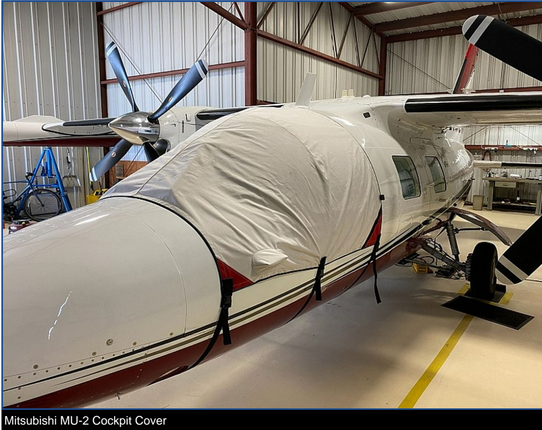
Mitsubishi MU-2 Cockpit Cover