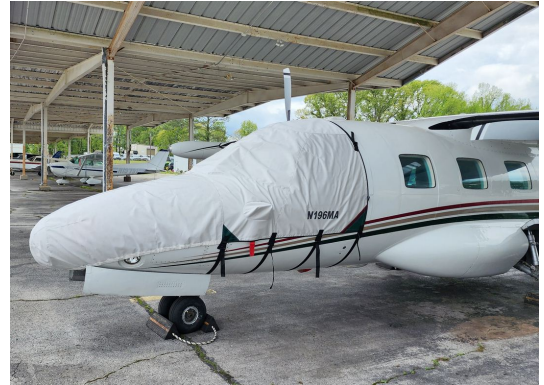
Mitsubishi MU-2B-60 Cockpit/Nose Cover