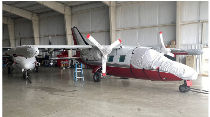
MU-2 Cockpit/Nose, Wing/Engine & Prop Covers