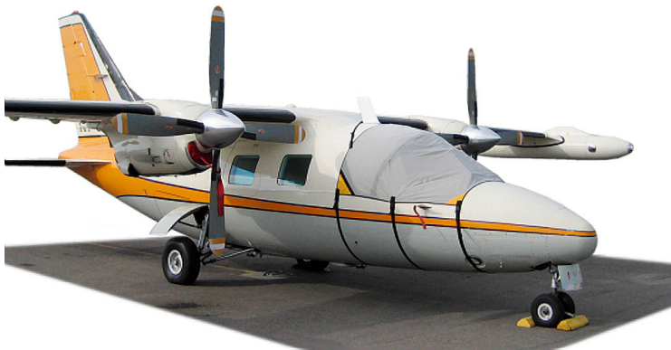
MU-2 Windshield Cover & Engine Plugs

Travel Covers are made with Silver Solution-Dyed Polyester fabric and only lined over the windshield to save weight. The material is lightweight and more compact for easy stowage in the aircraft. The polyester material is water resistant, but only intended for occasional use outside. We also have an ultra lightweight material available for fitted hangar dust covers. For daily outdoor use, the non-travel Sunbrella Cover is the best choice.