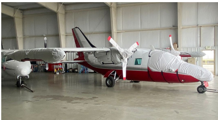
MU-2 Cockpit/Nose, Wing/Engine & Prop Covers

WINTER USE MATERIAL - Made with Solution-Dyed Polyester fabric, this option is intended for seasonal use to aid in deicing, rain mitigation, or for occasional travel. The material is lighter and more compact, but more susceptible to UV damage and may have a shorter useful life if used continuously outside than the all-year use material.