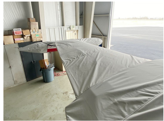
MU-2 Wing/Engine Covers