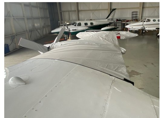
MU-2 Wing/Engine Covers