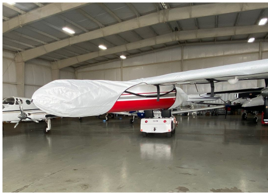
MU-2 Wing/Engine Covers

WINTER USE MATERIAL - Made with Solution-Dyed Polyester fabric, this option is intended for seasonal use to aid in deicing, rain mitigation, or for occasional travel. The material is lighter and more compact, but more susceptible to UV damage and may have a shorter useful life if used continuously outside than the all-year use material.