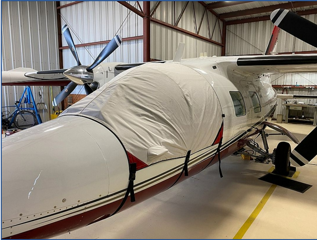
Mitsubishi MU-2 Cockpit Cover