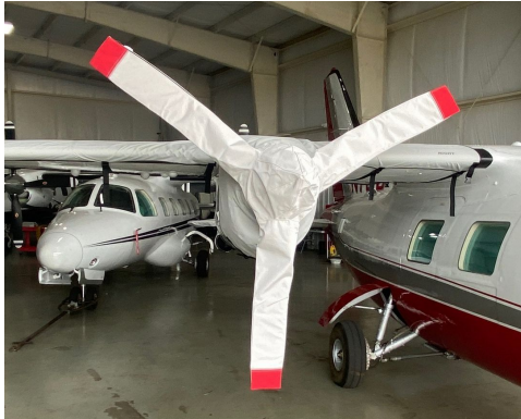
MU-2 Cockpit/Nose, Wing/Engine & Prop Covers

This cover type is made from Silver Acrylic Sunbrella canvas and is 100% lined with a soft and smooth microfiber. Bruce's Custom Covers developed this material combination especially for aircraft protection. The outer material is medium weight and treated for water resistance, UV resistance and anti-static buildup. The inner lining is a very soft and smooth microfiber to prevent scratching. The material is very reflective, and tests show that the cabin interior temperature can be reduced to near-ambient temperature on the hottest of days. It is water, ice and snow repellent, yet breathable to allow moisture to escape from between the cover and the aircraft surface.