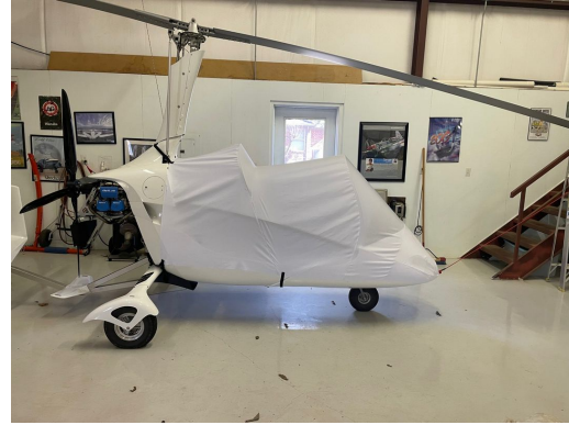
MTO Sport Gyrocopter Canopy/Nose Cover, test fit cover