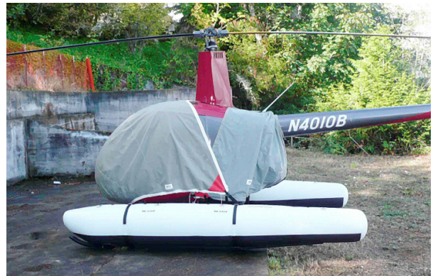
Robinson R-22 Standard Bubble Cover & Engine Cover