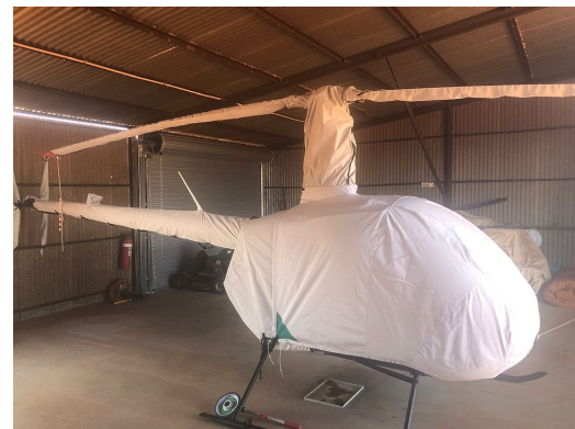
Robinson R-22 Full Cover Set