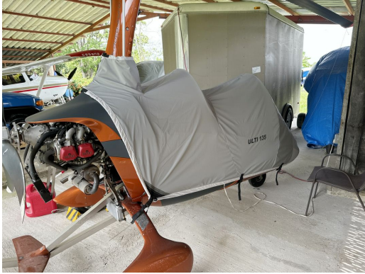
MTO Sport Travel Weight Canopy/Nose Cover

Travel Covers are made with Silver Solution-Dyed Polyester fabric and fully lined over the entire cover. The material is lightweight and more compact for easy stowage in the aircraft. The polyester material is water resistant, but only intended for occasional use outside. We also have an ultra lightweight material available for fitted hangar dust covers. For daily outdoor use, the non-travel Sunbrella Cover is the best choice.