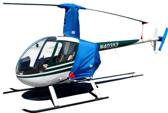
Robinson R-22 Engine, Rotor Mast & Tail Rotor Covers, with Blade Tie-down