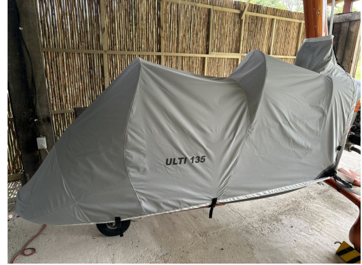
MTO Sport Travel Weight Canopy/Nose Cover