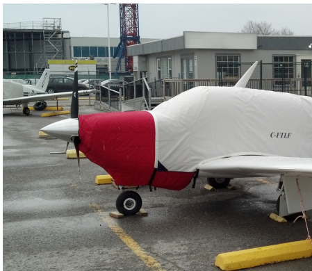
Mooney 201 Insulated Engine Cover, fully enclosed

This cover type is made from Silver Acrylic Sunbrella canvas and is 100% lined with a soft and smooth microfiber. Bruce's Custom Covers developed this material combination especially for aircraft protection. The outer material is medium weight and treated for water resistance, UV resistance and anti-static buildup. The inner lining is a very soft and smooth microfiber to prevent scratching. The material is very reflective, and tests show that the cabin interior temperature can be reduced to near-ambient temperature on the hottest of days. It is water, ice and snow repellent, yet breathable to allow moisture to escape from between the cover and the aircraft surface.