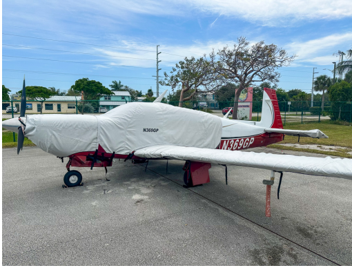
Mooney M20M Extended Canopy, Engine & Wing Covers

WINTER USE MATERIAL - Made with Solution-Dyed Polyester fabric, this option is intended for seasonal use to aid in deicing, rain mitigation, or for occasional travel. The material is lighter and more compact, but more susceptible to UV damage and may have a shorter useful life if used continuously outside than the all-year use material.