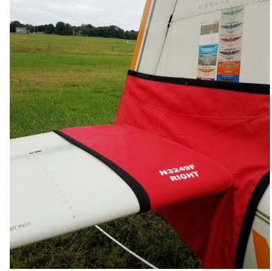
Mooney M20E Tailcone Cover