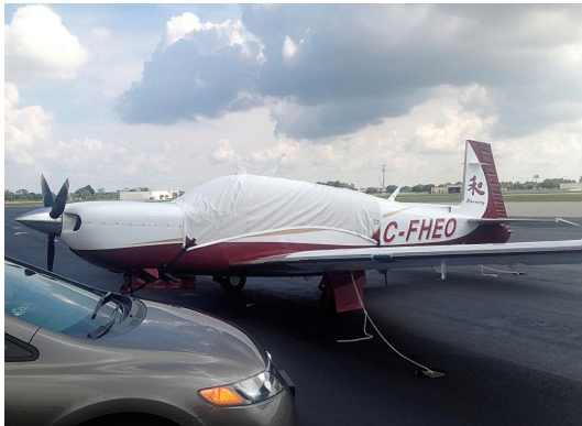
Mooney TLS Canopy Cover