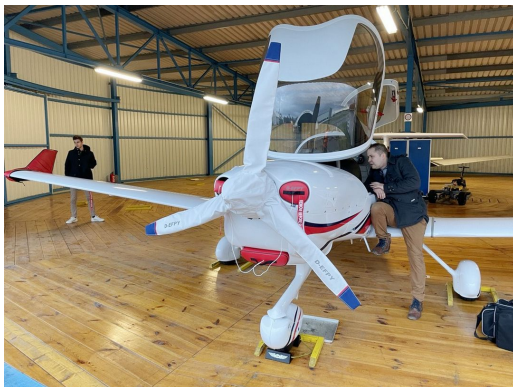
DA40 NG Engine Plugs

Designed to prevent damage to the aircraft extremities in crowded hangars, these products are made of bright red Naugahyde and thickly padded with a sandwich of closed cell foam.