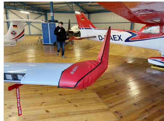
Diamond DA-40 Wingtip Pads