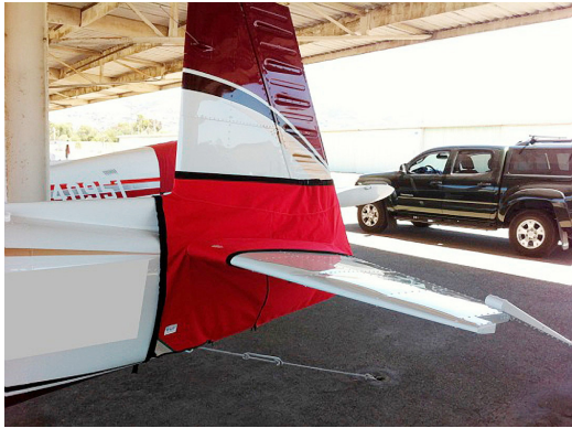
Mooney Tailcone Cover, completely enclosed

WINTER USE MATERIAL - Made with Solution-Dyed Polyester fabric, this option is intended for seasonal use to aid in deicing, rain mitigation, or for occasional travel. The material is lighter and more compact, but more susceptible to UV damage and may have a shorter useful life if used continuously outside than the all-year use material.