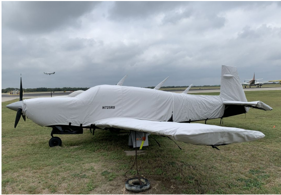
Mooney M20M Bravo Cover Set