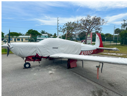
Mooney M20M Extended Canopy, Engine & Wing Covers