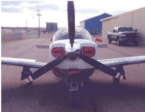
Mooney M20M TLS Engine Plugs

Engine Inlet Plugs are custom fit for your Mooney TLS, Bravo, Acclaim TN, Type S, & Porsche Powered Models intakes, made with heavy-duty vinyl material, and stuffed with a single block of sculpted urethane foam. Each plug has a zipper that allows the foam to be removed and dried if necessary. Engine plugs have warning flags that are visible from the cockpit or 'remove before flight' streamers sewn onto the face of the plugs. Most plugs are imprinted with the aircraft registration number in black for an extra charge. Storage bag NOT included. Engine plugs may be inserted after flight when the engine is still warm. Engine Inlet Plugs are commonly referred to as Cowl Plugs, Intake Plugs, Cowl Blocks, Engine Blocks, and Engine Bungs.