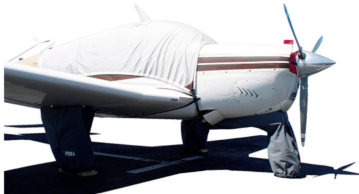
Beech Bonanza/Debonair/Baron Landing Gear Covers