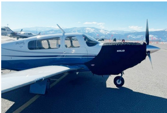
Mooney Bravo Insulated Engine Cover, Fully Enclosed