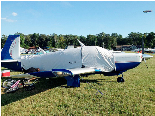
Mooney 231 Extended Canopy Cover

This cover type is made from Silver Acrylic Sunbrella canvas and is 100% lined with a soft and smooth microfiber. Bruce's Custom Covers developed this material combination especially for aircraft protection. The outer material is medium weight and treated for water resistance, UV resistance and anti-static buildup. The inner lining is a very soft and smooth microfiber to prevent scratching. The material is very reflective, and tests show that the cabin interior temperature can be reduced to near-ambient temperature on the hottest of days. It is water, ice and snow repellent, yet breathable to allow moisture to escape from between the cover and the aircraft surface.