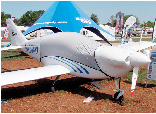
MySky Fly-Away Travel Cover

Travel Covers are made with Silver Solution-Dyed Polyester fabric and only lined over the windshield to save weight. The material is lightweight and more compact for easy stowage in the aircraft. The polyester material is water resistant, but only intended for occasional use outside. We also have an ultra lightweight material available for fitted hangar dust covers. For daily outdoor use, the non-travel Sunbrella Cover is the best choice.