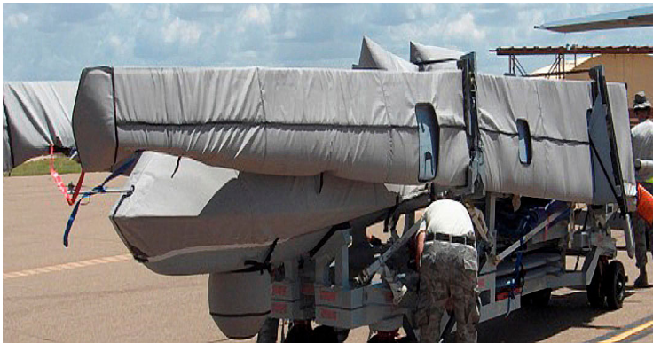
MQ1 Fuselage and Wing Covers