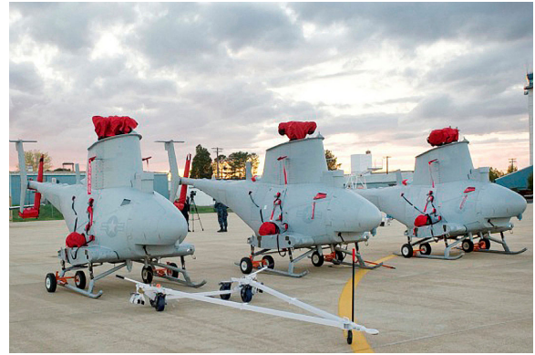
Northrup Grumman MQ-8 Firescout Plugs and Covers