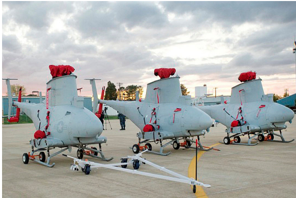
Northrup Grumman MQ-8 Fire Scout Plugs and Covers

necessary. Engine plugs have 'Remove Before Flight' streamers sewn onto the face of the plugs. Most plugs are imprinted with the aircraft registration number in black for an extra charge. Storage bag NOT included. Engine plugs may be inserted after flight when the engine is still warm. Engine Inlet Plugs are commonly referred to as Cowl Plugs, Intake Plugs, Cowl Blocks, Engine Blocks, and Engine Bunges.