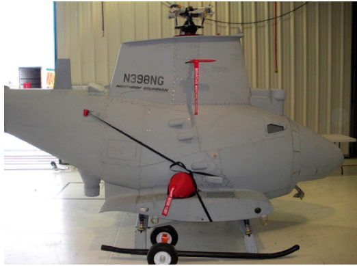
Covers & Plugs for the Northrup Grumman MQ-8 Fire Scout

necessary. Engine plugs have 'Remove Before Flight' streamers sewn onto the face of the plugs. Most plugs are imprinted with the aircraft registration number in black for an extra charge. Storage bag NOT included. Engine plugs may be inserted after flight when the engine is still warm. Engine Inlet Plugs are commonly referred to as Cowl Plugs, Intake Plugs, Cowl Blocks, Engine Blocks, and Engine Bunges.