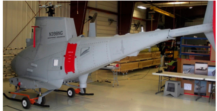
Covers & Plugs for the Northrup Grumman MQ-8 Fire Scout