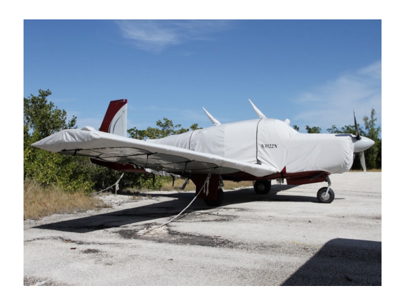
Mooney M20C Extended Canopy/Engine & Wing Covers