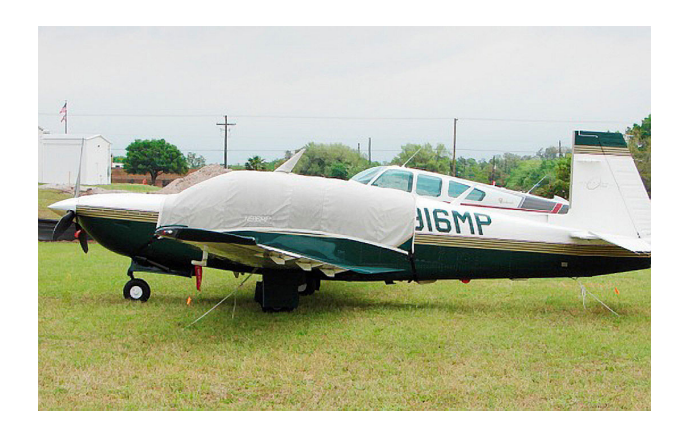
Mooney Ovation Canopy Cover

This cover type is made from Silver Acrylic Sunbrella canvas and is 100% lined with a soft and smooth microfiber. Bruce's Custom Covers developed this material combination especially for aircraft protection. The outer material is medium weight and treated for water resistance, UV resistance and anti-static buildup. The inner lining is a very soft and smooth microfiber to prevent scratching. The material is very reflective, and tests show that the cabin interior temperature can be reduced to near-ambient temperature on the hottest of days. It is water, ice and snow repellent, yet breathable to allow moisture to escape from between the cover and the aircraft surface.