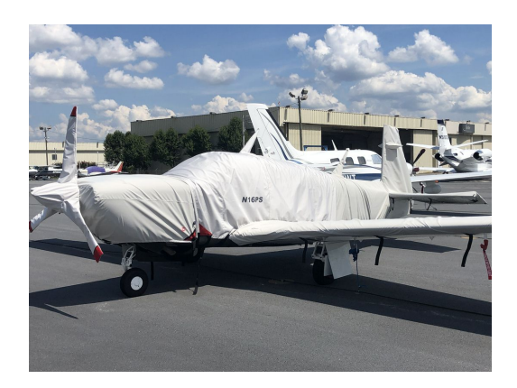
Mooney M20TN Acclaim Full Cover Set

This cover type is made from Silver Acrylic Sunbrella canvas and is 100% lined with a soft and smooth microfiber. Bruce's Custom Covers developed this material combination especially for aircraft protection. The outer material is medium weight and treated for water resistance, UV resistance and anti-static buildup. The inner lining is a very soft and smooth microfiber to prevent scratching. The material is very reflective, and tests show that the cabin interior temperature can be reduced to near-ambient temperature on the hottest of days. It is water, ice and snow repellent, yet breathable to allow moisture to escape from between the cover and the aircraft surface.