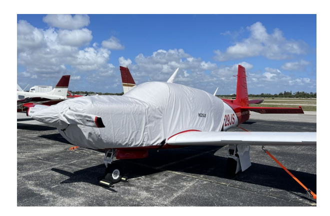
Mooney M20K Extended Canopy/Engine Cover, Prop Cover