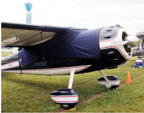
Cessna 195 Canopy Cover, extended forward and over gas caps

The material is very reflective, and tests show that the cabin interior temperature can be reduced to near-ambient temperature on the hottest of days. It is water, ice and snow repellent, yet breathable to allow moisture to escape from between the cover and the aircraft surface.