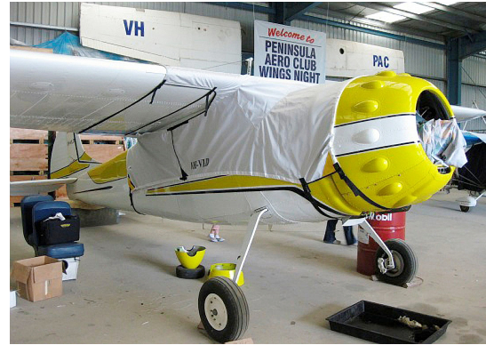
Cessna 195 Canopy Cover, over-top, 24" fwd ext to cover cowl ring gap, gas cap ext.