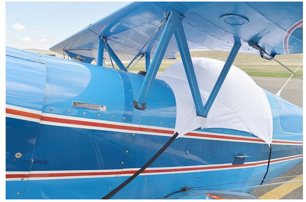
Acro Sport Canopy Cover