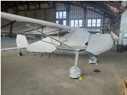
Cessna 140 Canopy, Wings, Prop, Tires & Empennage Covers