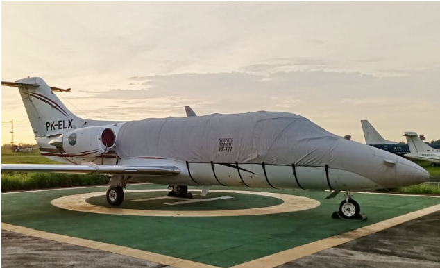
Beechjet Fuselage/Nose Cover

This cover type is made from Silver Acrylic Sunbrella canvas and is 100% lined with a soft and smooth microfiber. Bruce's Custom Covers developed this material combination especially for aircraft protection. The outer material is medium weight and treated for water resistance, UV resistance and anti-static buildup. The inner lining is a very soft and smooth microfiber to prevent scratching. The material is very reflective, and tests show that the cabin interior temperature can be reduced to near-ambient temperature on the hottest of days. It is water, ice and snow repellent, yet breathable to allow moisture to escape from between the cover and the aircraft surface.