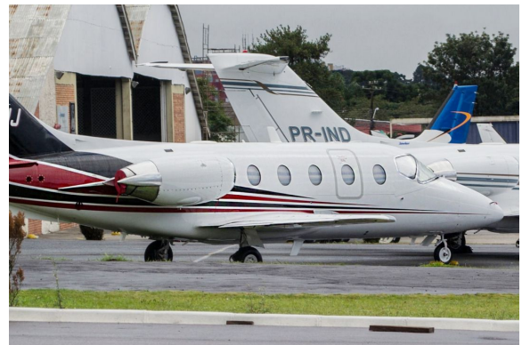
Beechjet Engine Plugs and Cockpit Heatshields