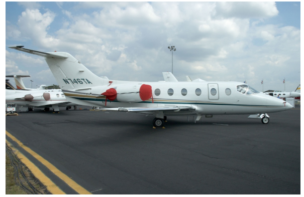
Beechjet 400 Engine Covers