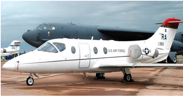
T-1A Jayhawk (Beechjet) Engine & Pitot Cover set