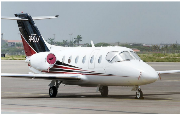
Beechjet Engine Plugs and Cockpit Heatshields

Cockpit Heatshields are interior sunshades for the aircraft's cockpit. The product is a unique composite of closed-cell foam with a silver mylar finish. The semi-rigid design is stiff enough to stand inside the window framing. The set folds up flat and is easily stored in the included storage sleeve. Some designs may require velcro and suction cups. Our Heatshields for jets are offered white side out because some aircraft manufacturers have issued advisories against reflective window inserts due to potential heat damage. A Heatshield is an excellent short-term remedy for cockpit overheating, but an external fabric cover is more effective for long-term protection.