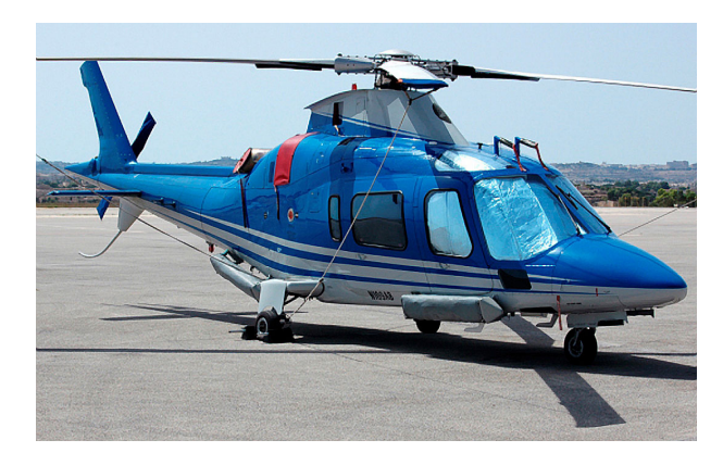
Agusta Power Cockpit HeatShields & Blade Tie-downs

Heatshields are interior sunshades for an aircraft's windows or canopy glass. The product is a unique composite of closed-cell foam with a silver mylar finish. The semi-rigid design is stiff enough to stand along the inside of the windshield using sun visors or window framing. It folds up flat and easily stores in the included storage sleeve. Some designs may require velcro and suction cups. A Heatshield is an excellent short-term remedy for cockpit overheating.