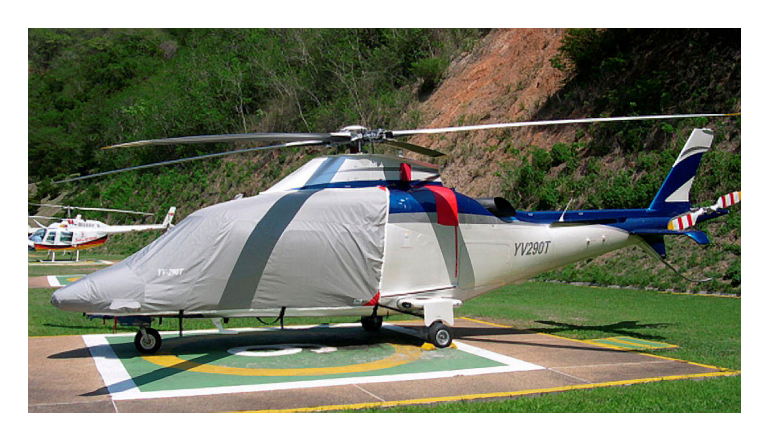
Agusta Grand Bubble Cover