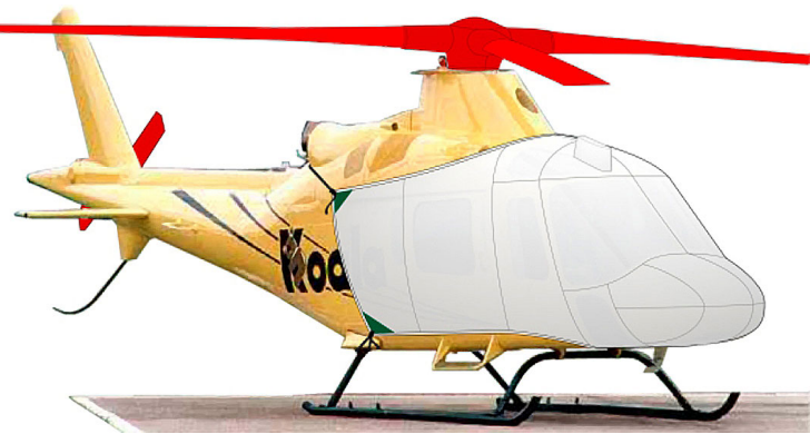
Koala Bubble, Rotor Hub, Blade & Tail Rotor Covers (illustration)