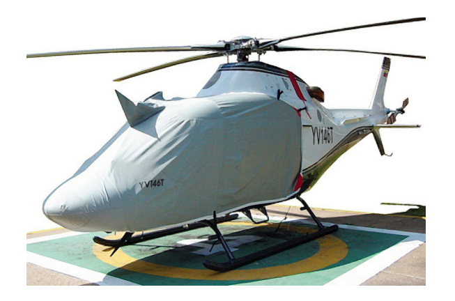
Koala Bubble Cover (with Wire Strike)