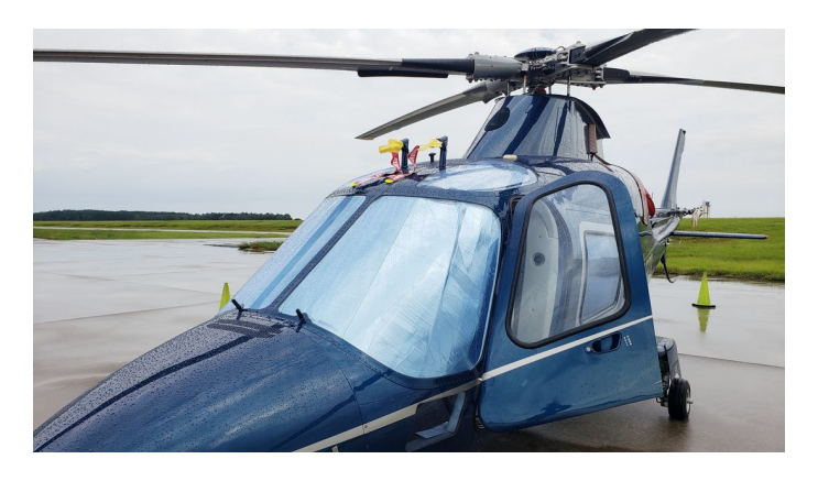
Agusta AW109S/SP Grand Heatshield Set