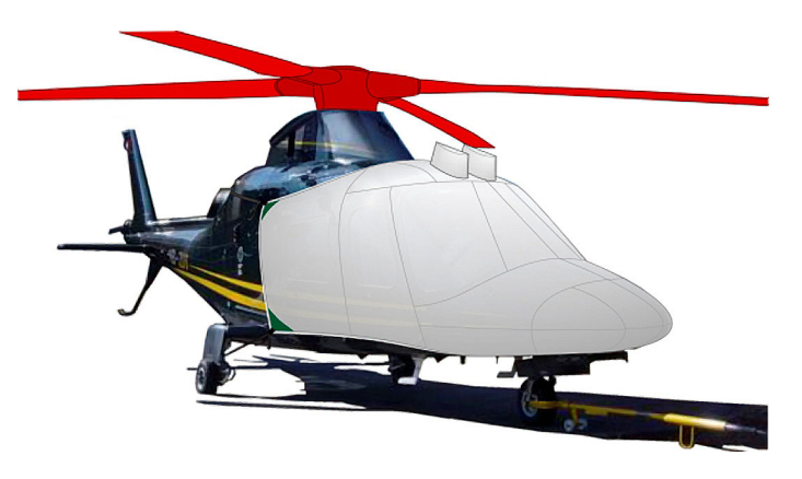
Agusta 109 Bubble, Rotor Hub & Blade Covers (illustration)

Travel Covers are made with Silver Solution-Dyed Polyester fabric and fully lined over the entire cover. The material is lightweight and more compact for easy stowage in the aircraft. The polyester material is water resistant, but only intended for occasional use outside. We also have an ultra lightweight material available for fitted hangar dust covers. For daily outdoor use, the non-travel Sunbrella Cover is the best choice.