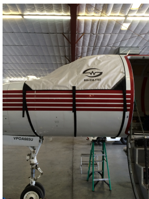
Merlin Cockpit Cover

This cover type is made from Silver Acrylic Sunbrella canvas and is 100% lined with a soft and smooth microfiber. Bruce's Custom Covers developed this material combination especially for aircraft protection. The outer material is medium weight and treated for water resistance, UV resistance and anti-static buildup. The inner lining is a very soft and smooth microfiber to prevent scratching. The material is very reflective, and tests show that the cabin interior temperature can be reduced to near-ambient temperature on the hottest of days. It is water, ice and snow repellent, yet breathable to allow moisture to escape from between the cover and the aircraft surface.