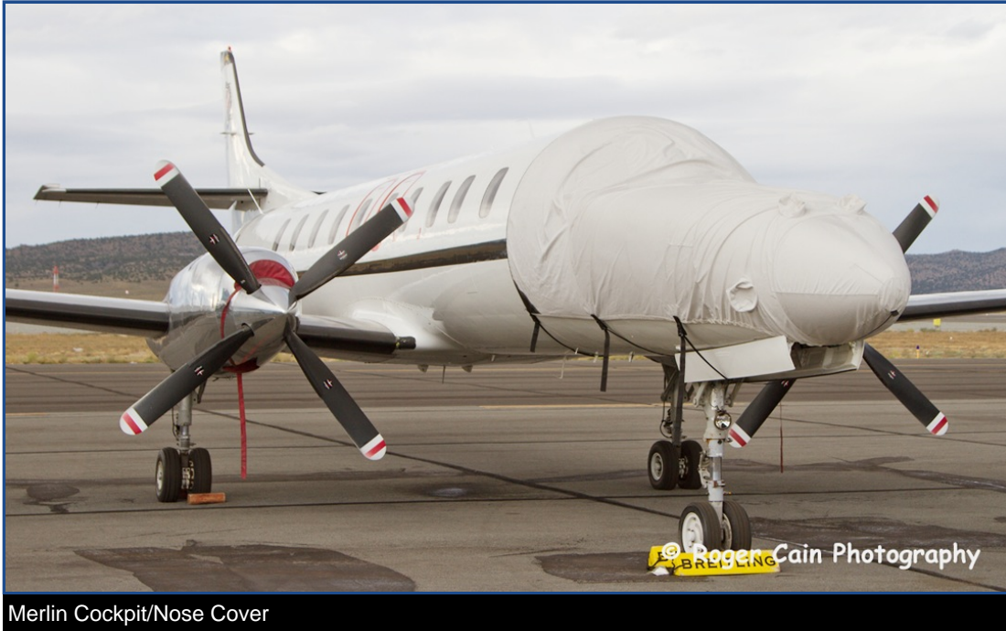
Merlin Cockpit/Nose Cover