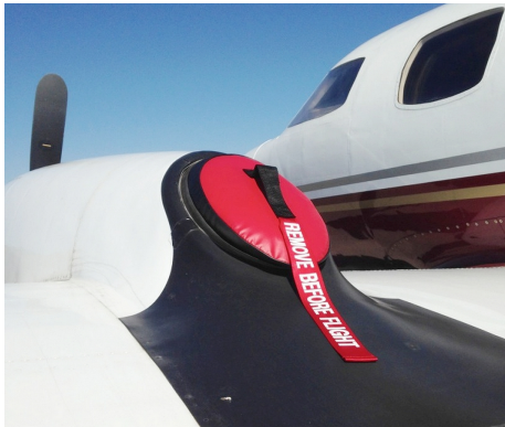
Merlin Exhaust Plug

Engine Inlet Plugs are custom fit for your Swearingen Fairchild Metro Merlin, all models intakes, made with heavy-duty vinyl material, and stuffed with a single block of sculpted urethane foam. Each plug has a zipper that allows the foam to be removed and dried if necessary. Engine plugs have warning flags that are visible from the cockpit or 'remove before flight' streamers sewn onto the face of the plugs. Most plugs are imprinted with the aircraft registration number in black for an extra charge. Storage bag NOT included. Engine plugs may be inserted after flight when the engine is still warm. Engine Inlet Plugs are commonly referred to as Cowl Plugs, Intake Plugs, Cowl Blocks, Engine Blocks, and Engine Bunges.