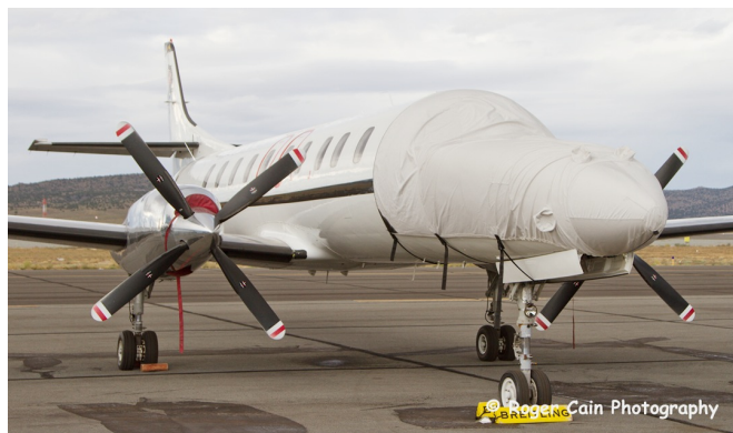
Merlin Cockpit/Nose Cover