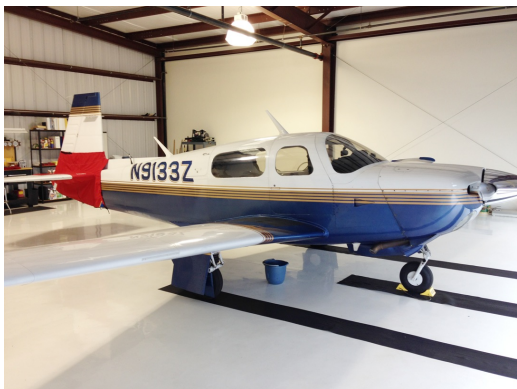
Mooney Tailcone Cover

WINTER USE MATERIAL - Made with Solution-Dyed Polyester fabric, this option is intended for seasonal use to aid in deicing, rain mitigation, or for occasional travel. The material is lighter and more compact, but more susceptible to UV damage and may have a shorter useful life if used continuously outside than the all-year use material.