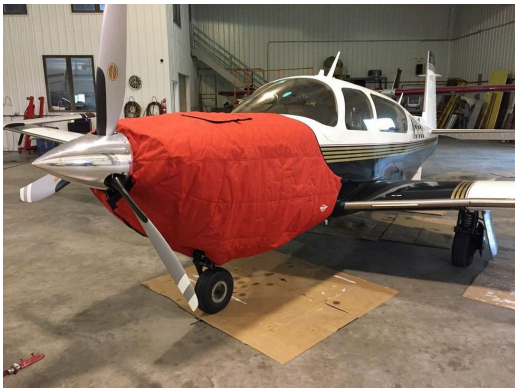
Mooney Ovation Insulated Engine Cover

This cover type is made from Silver Acrylic Sunbrella canvas and is 100% lined with a soft and smooth microfiber. Bruce's Custom Covers developed this material combination especially for aircraft protection. The outer material is medium weight and treated for water resistance, UV resistance and anti-static buildup. The inner lining is a very soft and smooth microfiber to prevent scratching. The material is very reflective, and tests show that the cabin interior temperature can be reduced to near-ambient temperature on the hottest of days. It is water, ice and snow repellent, yet breathable to allow moisture to escape from between the cover and the aircraft surface.