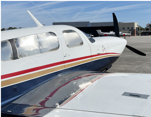
Mooney M20S Heatshield Set

Heatshields are interior sunshades for an aircraft's windows or canopy glass. The product is a unique composite of closed-cell foam with a silver mylar finish. The semi-rigid design is stiff enough to stand along the inside of the windshield using sun visors or window framing. It folds up flat and easily stores in the included storage sleeve. Some designs may require velcro and suction cups. A Heatshield is an excellent short-term remedy for cockpit overheating.