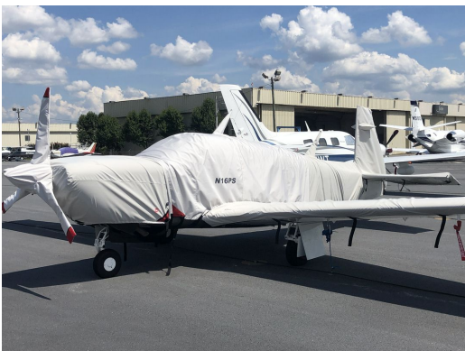
Mooney M20TN Acclaim Full Cover Set