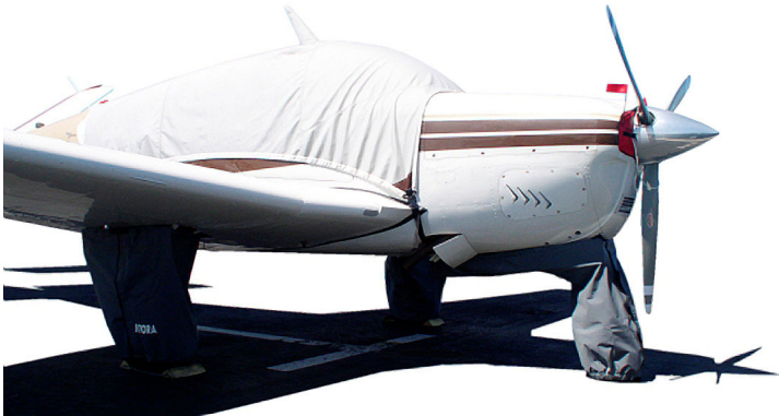
Beech Bonanza/Debonair/Baron Landing Gear Covers