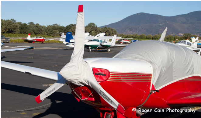
Mooney M20M Bravo 3-Blade Prop Cover, Engine Plugs

Engine Inlet Plugs are custom fit for your Mooney Eagle intakes, made with heavy-duty vinyl material, and stuffed with a single block of sculpted urethane foam. Each plug has a zipper that allows the foam to be removed and dried if necessary. Engine plugs have warning flags that are visible from the cockpit or 'remove before flight' streamers sewn onto the face of the plugs. Most plugs are imprinted with the aircraft registration number in black for an extra charge. Storage bag NOT included. Engine plugs may be inserted after flight when the engine is still warm. Engine Inlet Plugs are commonly referred to as Cowl Plugs, Intake Plugs, Cowl Blocks, Engine Blocks, and Engine Bungs.