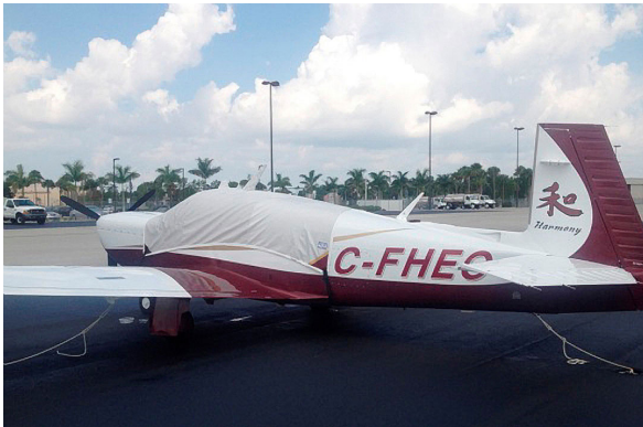
Mooney TLS Canopy Cover

Travel Covers are made with Silver Solution-Dyed Polyester fabric and only lined over the windshield to save weight. The material is lightweight and more compact for easy stowage in the aircraft. The polyester material is water resistant, but only intended for occasional use outside. We also have an ultra lightweight material available for fitted hangar dust covers. For daily outdoor use, the non-travel Sunbrella Cover is the best choice.