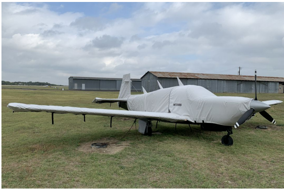
Mooney M20M Bravo Cover Set