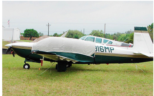
Mooney Ovation Canopy Cover