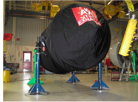
PW JT8D Off-Link Engine Transport Cover (no nose cone, no TR's), fully enclosed