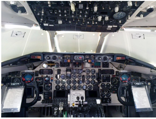
McDonnell Douglas MD80 Cockpit Heatshield Set