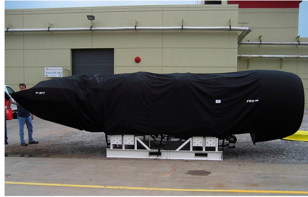
PW JT8D Off-Link Engine Shower Cap Cover Set PW JT8D Off-Link Engine Storage Cover w/ Nose Cowl & TR's, "Rain Cap" style