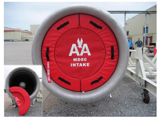
MD-80 JT8D Intake Plug, mesh center & folding type