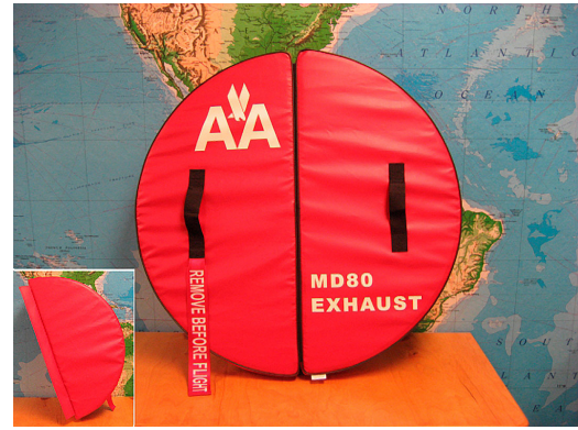
MD-80 Exhaust Plug, folding type