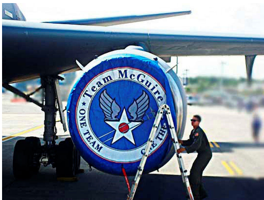
McDonnell Douglas KC-10 Intake Cover