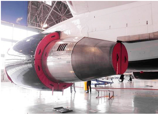
Exhaust Plugs Ship Set, incl. Fan Thrust Reverser and Exhaust Plugs P/N: B767-200 Exhaust Plugs Ship Set, incl. Fan Thrust Reverser and Exhaust Plugs P/N: B767-200