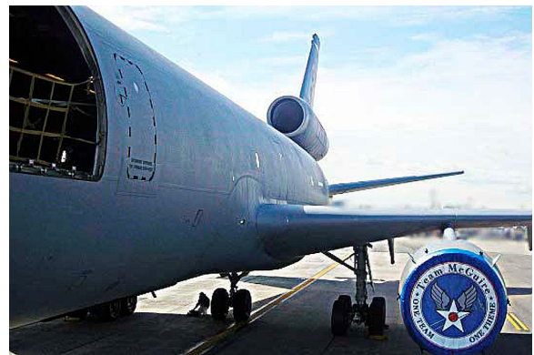
KC-10 Intake Cover at McGuire AFB, NJ