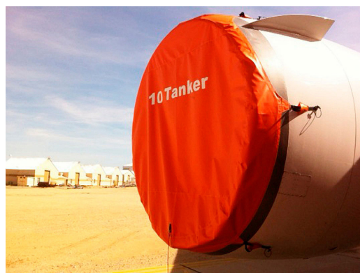
DC-10-30 Intake Cover (CF650C2 Engine)