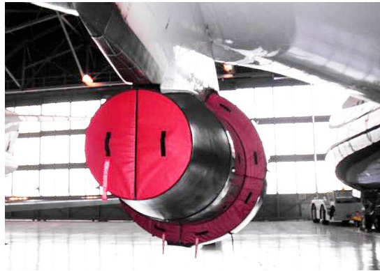
DC-10 Bypass Vent, Exhaust Plug set