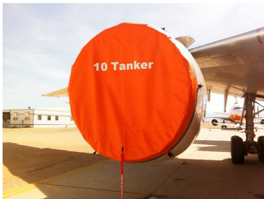
DC-10 Intake Cover