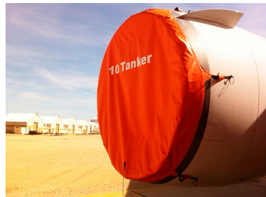
DC-10-30 Intake Cover (CF650C2 Engine)