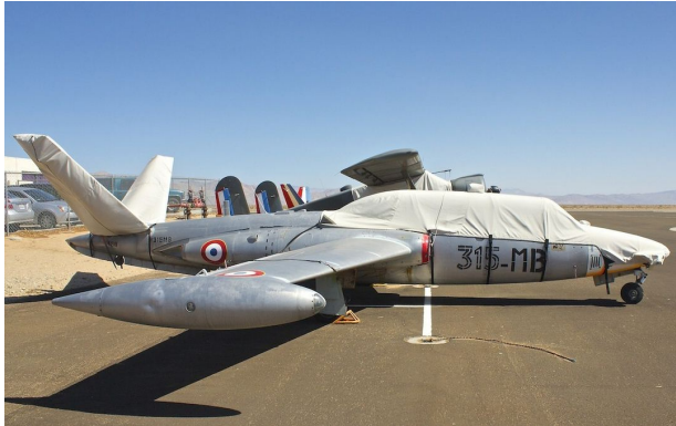
Fouga Magister Canopy/Nose Cover, Tail Stabilizer Covers

This cover type is made from Silver Acrylic Sunbrella canvas and is 100% lined with a soft and smooth microfiber. Bruce's Custom Covers developed this material combination especially for aircraft protection. The outer material is medium weight and treated for water resistance, UV resistance and anti-static buildup. The inner lining is a very soft and smooth microfiber to prevent scratching. The material is very reflective, and tests show that the cabin interior temperature can be reduced to near-ambient temperature on the hottest of days. It is water, ice and snow repellent, yet breathable to allow moisture to escape from between the cover and the aircraft surface.