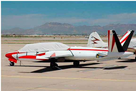
Fouga Magister Canopy Cover

Travel Covers are made with Silver Solution-Dyed Polyester fabric and only lined over the windshield to save weight. The material is lightweight and more compact for easy stowage in the aircraft. The polyester material is water resistant, but only intended for occasional use outside. We also have an ultra lightweight material available for fitted hangar dust covers. For daily outdoor use, the non-travel Sunbrella Cover is the best choice.