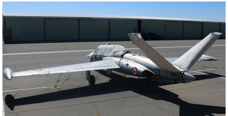
Fouga Magister Canopy/Nose Cover, Tail Stabilizer Covers