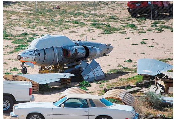
Fouga Magister Canopy Cover