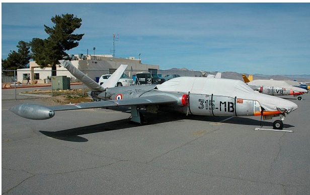
Fouga Magister Canopy/Nose Cover & Tail Stabilizer Covers

WINTER USE MATERIAL - Made with Solution-Dyed Polyester fabric, this option is intended for seasonal use to aid in deicing, rain mitigation, or for occasional travel. The material is lighter and more compact, but more susceptible to UV damage and may have a shorter useful life if used continuously outside than the all-year use material.