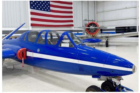
Fouga Magister CM170 Intake Plugs