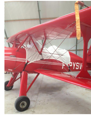
Starduster Too Canopy Cover