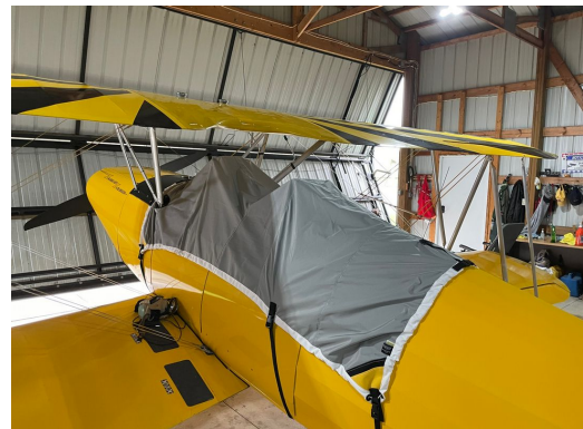
Marquardt Charger Travel Weight Canopy Cover