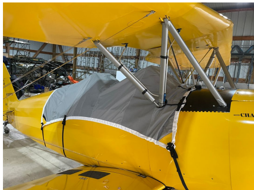
Marquardt Charger Travel Weight Canopy Cover

This cover type is made from Silver Acrylic Sunbrella canvas and is 100% lined with a soft and smooth microfiber. Bruce's Custom Covers developed this material combination especially for aircraft protection. The outer material is medium weight and treated for water resistance, UV resistance and anti-static buildup. The inner lining is a very soft and smooth microfiber to prevent scratching. The material is very reflective, and tests show that the cabin interior temperature can be reduced to near-ambient temperature on the hottest of days. It is water, ice and snow repellent, yet breathable to allow moisture to escape from between the cover and the aircraft surface.