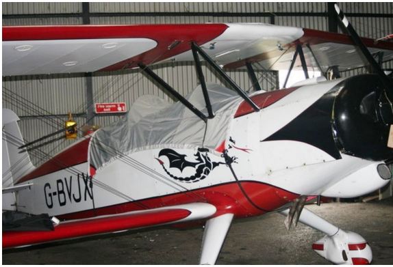
Marquardt Charger MA-5 Canopy Cover