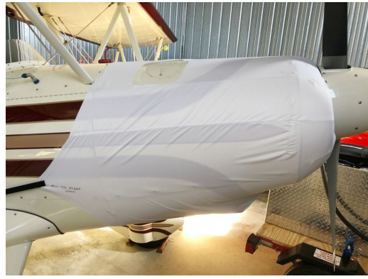
Marquardt Charger Insulated Engine Cover (test fit cover_