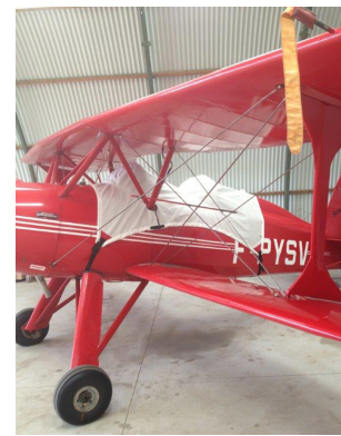
Starduster Too Canopy Cover