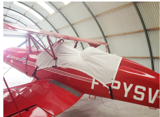
Starduster Too Canopy Cover