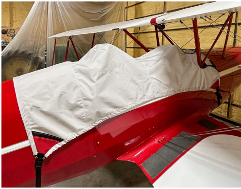
Marquardt Charger MA-5 Cockpit Cover