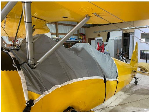
Marquardt Charger Travel Weight Canopy Cover

This cover type is made from Silver Acrylic Sunbrella canvas and is 100% lined with a soft and smooth microfiber. Bruce's Custom Covers developed this material combination especially for aircraft protection. The outer material is medium weight and treated for water resistance, UV resistance and anti-static buildup. The inner lining is a very soft and smooth microfiber to prevent scratching. The material is very reflective, and tests show that the cabin interior temperature can be reduced to near-ambient temperature on the hottest of days. It is water, ice and snow repellent, yet breathable to allow moisture to escape from between the cover and the aircraft surface.