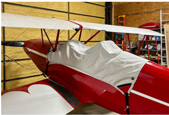
Marquardt Charger MA-5 Cockpit Cover