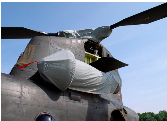
Boeing Vertol CH-47 Engine and Rotor Hub Covers

Insulated Covers Material - A special composite material of solution-dyed polyester, 3M Thinsulate insulation, and soft nylon interior fabric. Our insulated covers are designed to complement an engine preheater and help retain heat in the engine compartment after shutdown. If you operate your aircraft in cold-weather, these covers will help prevent engine wear and tear.