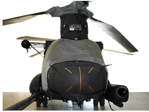
Boeing Vertol CH-47 Forward Cabin & Rotor Hub Cover