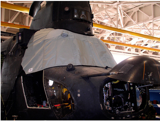
Boeing Vertol CH-47 Windshield/Cockpit Cover