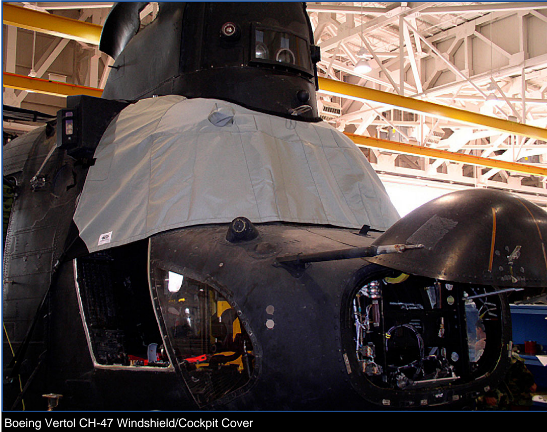
Boeing Vertol CH-47 Windshield/Cockpit Cover