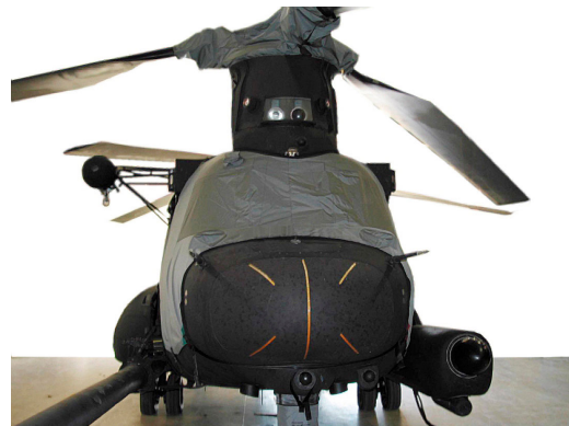
Boeing Vertol CH-47 Forward Cabin & Rotor Hub Cover