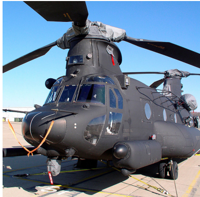
Boeing Vertol MH-47 Rotor Hubs, Engine & Other Covers