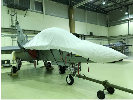
Alenia Aermacchi M-346 Canopy/Nose Cover

This cover type is made from Silver Acrylic Sunbrella canvas and is 100% lined with a soft and smooth microfiber. Bruce's Custom Covers developed this material combination especially for aircraft protection. The outer material is medium weight and treated for water resistance, UV resistance and anti-static buildup. The inner lining is a very soft and smooth microfiber to prevent scratching. The material is very reflective, and tests show that the cabin interior temperature can be reduced to near-ambient temperature on the hottest of days. It is water, ice and snow repellent, yet breathable to allow moisture to escape from between the cover and the aircraft surface.