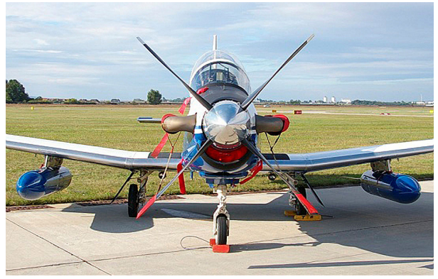
Texan II T6A Engine Inlet Plug, Prop Tie/Exhaust Covers