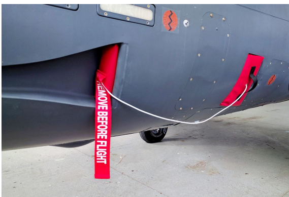
Embraer EMB 312 Tucano Side Naca Plugs

Engine Inlet Plugs are custom fit for your Embraer EMB 312 Tucano, T-27 intakes, made with heavy-duty vinyl material, and stuffed with a single block of sculpted urethane foam. Each plug has a zipper that allows the foam to be removed and dried if necessary. Engine plugs have warning flags that are visible from the cockpit or 'remove before flight' streamers sewn onto the face of the plugs. Most plugs are imprinted with the aircraft registration number in black for an extra charge. Storage bag NOT included. Engine plugs may be inserted after flight when the engine is still warm. Engine Inlet Plugs are commonly referred to as Cowl Plugs, Intake Plugs, Cowl Blocks, Engine Blocks, and Engine Bungs.