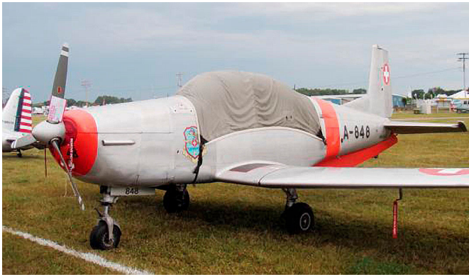
Pilatus P-3 Canopy Cover