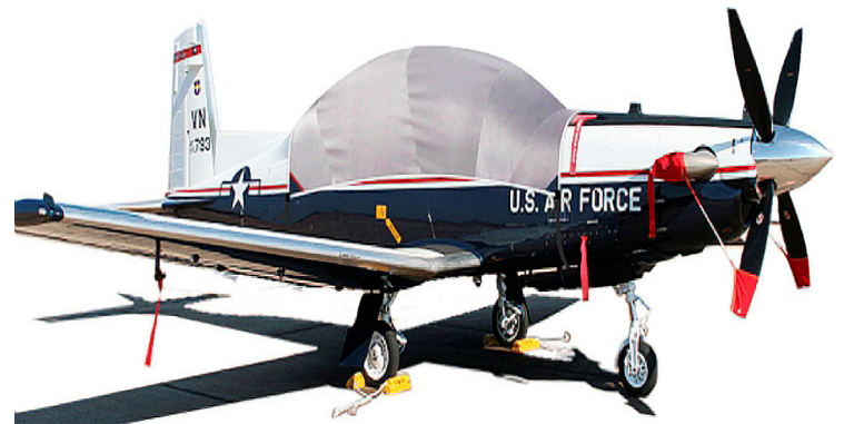
Texan II T6A Canopy Cover, Engine Inlet Plug, Prop Tie/Exhaust Covers, Pitot Cover