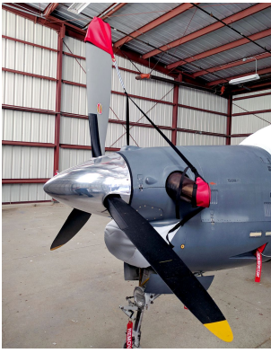
Embraer EMB 312 Tucano Prop Tie Down/Exhaust Covers