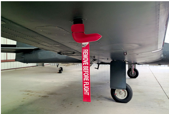
Embraer EMB 312 Tucano Pitot Covers

Engine Inlet Plugs are custom fit for your Embraer EMB 312 Tucano, T-27 intakes, made with heavy-duty vinyl material, and stuffed with a single block of sculpted urethane foam. Each plug has a zipper that allows the foam to be removed and dried if necessary. Engine plugs have warning flags that are visible from the cockpit or 'remove before flight' streamers sewn onto the face of the plugs. Most plugs are imprinted with the aircraft registration number in black for an extra charge. Storage bag NOT included. Engine plugs may be inserted after flight when the engine is still warm. Engine Inlet Plugs are commonly referred to as Cowl Plugs, Intake Plugs, Cowl Blocks, Engine Blocks, and Engine Bunges.