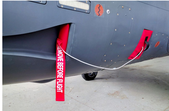
Embraer EMB 312 Tucano Side Naca Plugs