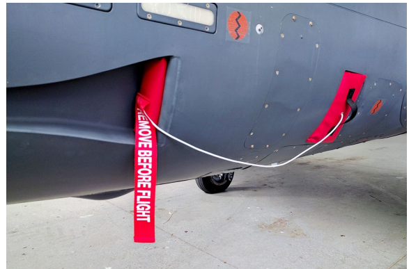
Embraer EMB 312 Tucano Side Naca Plugs