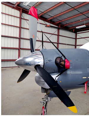
Embraer EMB 312 Tucano Prop Tie Down/Exhaust Covers