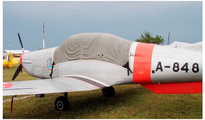
Pilatus P-3 Canopy Cover