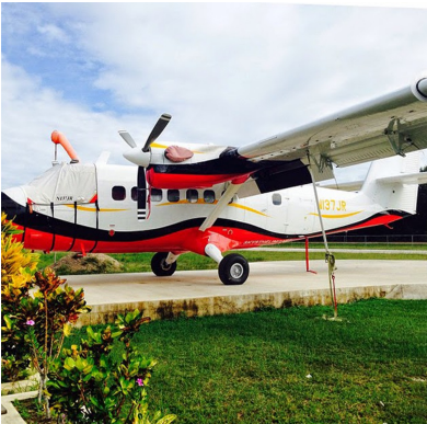
Twin Otter Cockpit Cover & Engine Plugs

This cover type is made from Silver Acrylic Sunbrella canvas and is 100% lined with a soft and smooth microfiber. Bruce's Custom Covers developed this material combination especially for aircraft protection. The outer material is medium weight and treated for water resistance, UV resistance and anti-static buildup. The inner lining is a very soft and smooth microfiber to prevent scratching. The material is very reflective, and tests show that the cabin interior temperature can be reduced to near-ambient temperature on the hottest of days. It is water, ice and snow repellent, yet breathable to allow moisture to escape from between the cover and the aircraft surface.