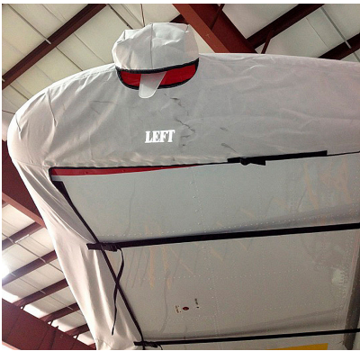
De Havilland Twin Otter Wing Cover wing tip detail

mitigation, or for occasional travel. The material is lighter and more compact, but more susceptible to UV damage and may have a shorter useful life if used continuously outside than the all-year use material.