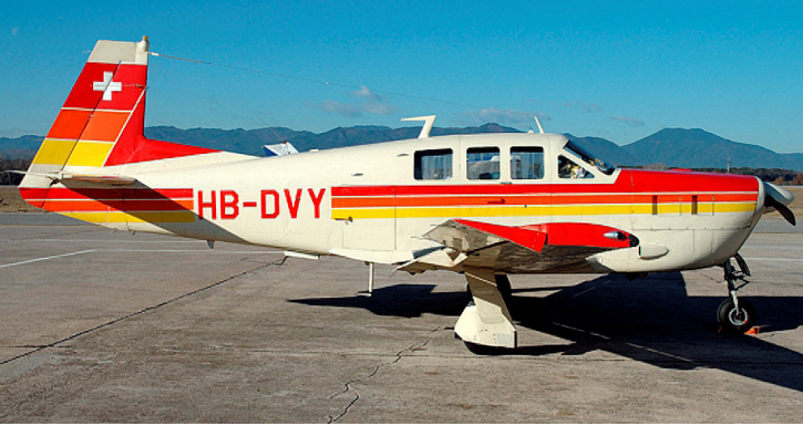
Mooney M20 Extended Canopy Cover & Engine Plugs