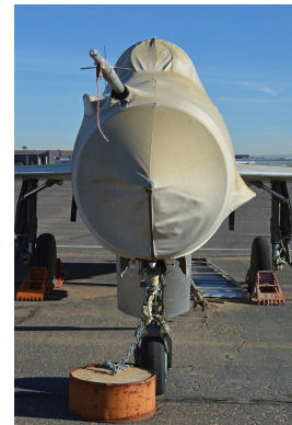
Mig 21 Canopy/Nose Cover