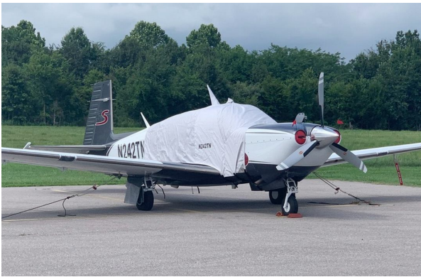
Mooney M20TN Extended Canopy Cover