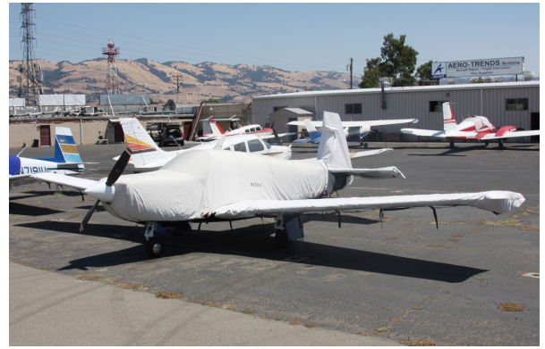
Mooney 231 Full Cover Set