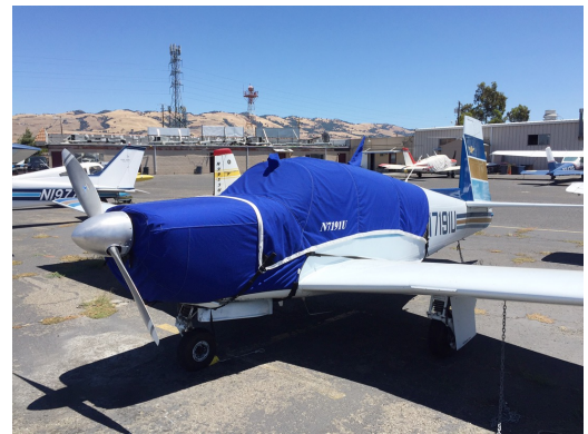
Mooney M20 Canopy & Engine Cover