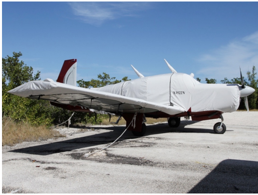
Mooney M20C Extended Canopy/Engine & Wing Covers