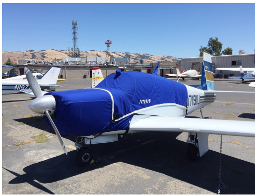
Mooney M20 Canopy & Engine Cover

This cover type is made from Silver Acrylic Sunbrella canvas and is 100% lined with a soft and smooth microfiber. Bruce's Custom Covers developed this material combination especially for aircraft protection. The outer material is medium weight and treated for water resistance, UV resistance and anti-static buildup. The inner lining is a very soft and smooth microfiber to prevent scratching. The material is very reflective, and tests show that the cabin interior temperature can be reduced to near-ambient temperature on the hottest of days. It is water, ice and snow repellent, yet breathable to allow moisture to escape from between the cover and the aircraft surface.