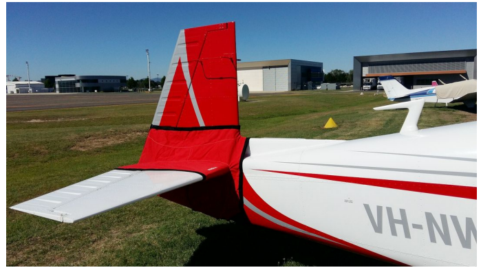
Mooney M20J Tailcone Cover