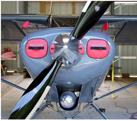
Piper PA-18 Super Cub Engine Inlet Plugs