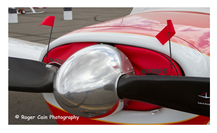
Meyer (Aero Commander) 200 Engine Plugs