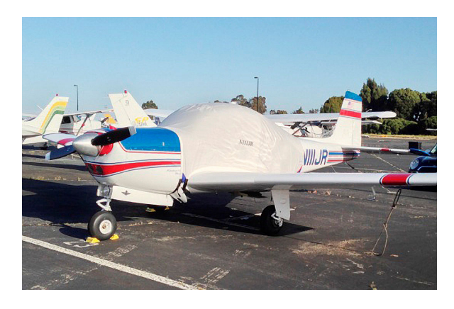
Meyers 200 Extended Canopy Cover & Engine Plugs