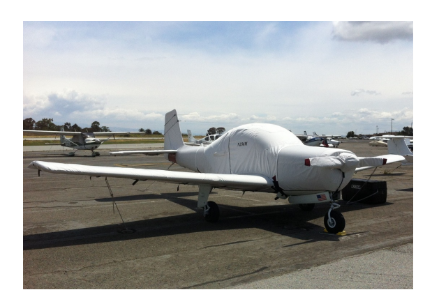
Meyers 200 Complete Cover Set