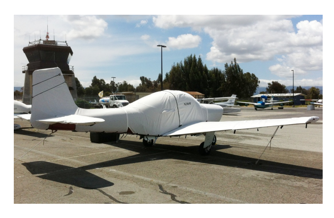
Meyers 200 Complete Cover Set