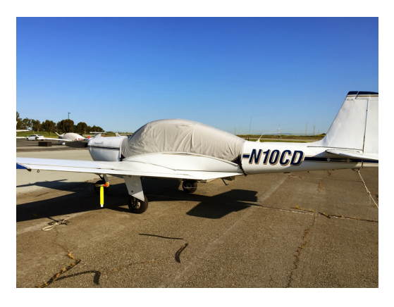
Meyer (Aero Commander) 200 Canopy Cover