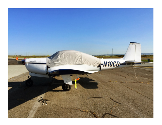
Meyer (Aero Commander) 200 Canopy Cover