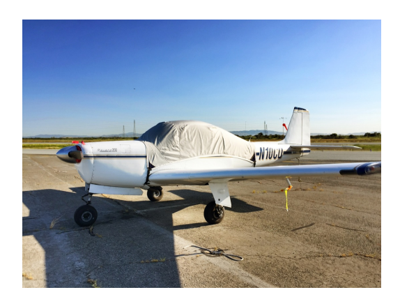
Meyer (Aero Commander) 200 Canopy Cover