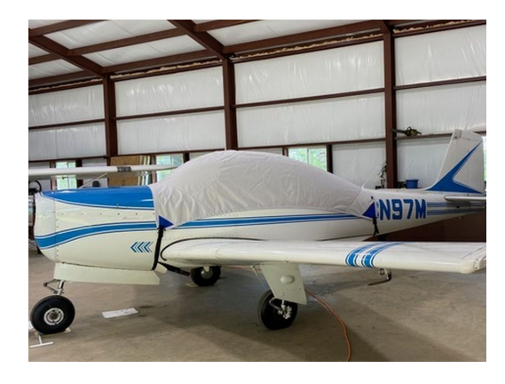
Meyers (Rockwell) 200 Canopy Cover

This cover type is made from Silver Acrylic Sunbrella canvas and is 100% lined with a soft and smooth microfiber. Bruce's Custom Covers developed this material combination especially for aircraft protection. The outer material is medium weight and treated for water resistance, UV resistance and anti-static buildup. The inner lining is a very soft and smooth microfiber to prevent scratching. The material is very reflective, and tests show that the cabin interior temperature can be reduced to near-ambient temperature on the hottest of days. It is water, ice and snow repellent, yet breathable to allow moisture to escape from between the cover and the aircraft surface.