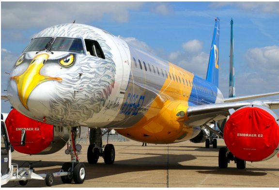
Embraer E195 Intake Covers