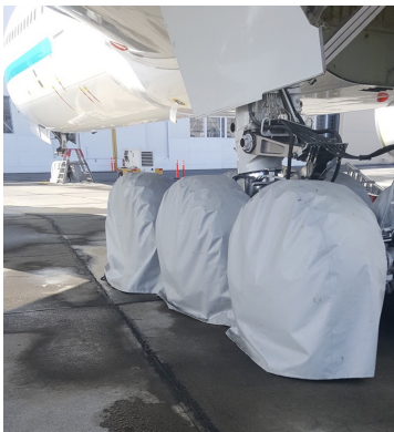
Boeing 777 Main & Nose Gear Tire Covers

ALL-YEAR USE MATERIAL - Made with Silver Acrylic Sunbrella canvas, the all-year use material is the best option for sun protection and cover longevity. This heavier more durable material is intended for all weather conditions, such as rain and snow or lots of sun.