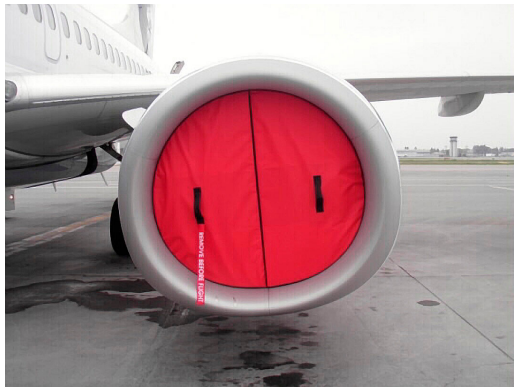
Boeing 737 Engine Intake Plug, Folding Type

The Engine Inlet Plugs are custom fit for your Embraer EMB-170/175 intakes, made with heavy-duty vinyl material, and stuffed with a single block of sculpted urethane foam. Each plug has a zipper that allows the foam to be removed and dried if necessary. Engine plugs have 'remove before flight' streamers sewn onto the face of the plugs. Most plugs are imprinted with the aircraft registration number in black for an extra charge. Storage bag NOT included. Engine plugs may be inserted after flight when the engine is still warm. Engine Inlet Plugs are commonly referred to as Cowl Plugs, Intake Plugs, Cowl Blocks, Engine Blocks, and Engine Bungs.