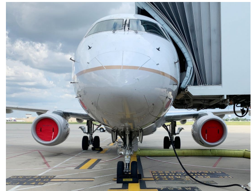
Embraer EMB-170/175 Engine Inlet Plugs