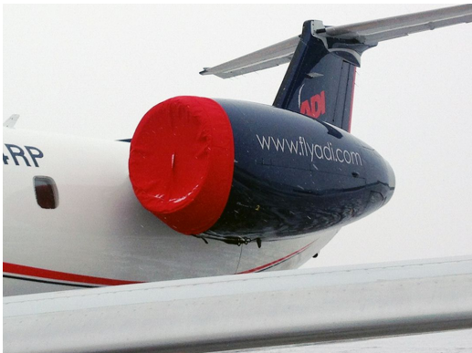
Embraer Legacy 650 Intake Covers

The Embraer ERJ-135/140/145 Legacy 600, 650 Intake Covers are designed to install easily yet be completely storable. A spring steel hoop is sewn into the hem of each cover, allowing them to be installed without climbing onto the wing or using a stepladder. To store the covers the spring steel hoop folds like a band-saw blade into three nesting rings. Each cover folds into a compact circular bundle which is stored in the included duffle bag, yet they unfold quickly for use. The Tri-Fold Ring cover is made of medium weight nylon which is available in a variety of colors to match the paint trim. Each cover set comes complete with installation and folding instructions. The aircraft's registration number can be silkscreened onto the cover for an extra charge.