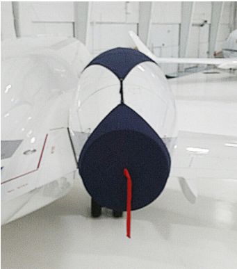
Embraer ERJ-135/140/145 Legacy 650 3-Strap Intake/Exhaust Cover Challenger 300 Intake/Exhaust Cover Set, 3-strap type