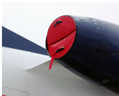
Embraer Legacy 650 Exhaust Plug