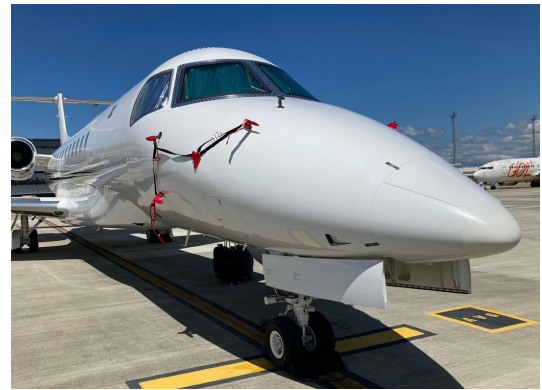
Embraer ERJ-135 Pitot/TAT/Ice Detector Covers