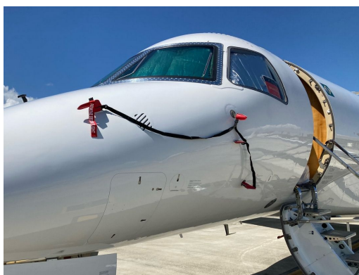
Embraer ERJ-135 Pitot/TAT/Ice Detector Covers

The Engine Inlet Plugs are custom fit for your Embraer ERJ-135/140/145 Legacy 600, 650 intakes, made with heavy-duty vinyl material, and stuffed with a single block of sculpted urethane foam. Each plug has a zipper that allows the foam to be removed and dried if necessary. Engine plugs have 'remove before flight' streamers sewn onto the face of the plugs. Most plugs are imprinted with the aircraft registration number in black for an extra charge. Storage bag NOT included. Engine plugs may be inserted after flight when the engine is still warm. Engine Inlet Plugs are commonly referred to as Cowl Plugs, Intake Plugs, Cowl Blocks, Engine Blocks, and Engine Bungs.