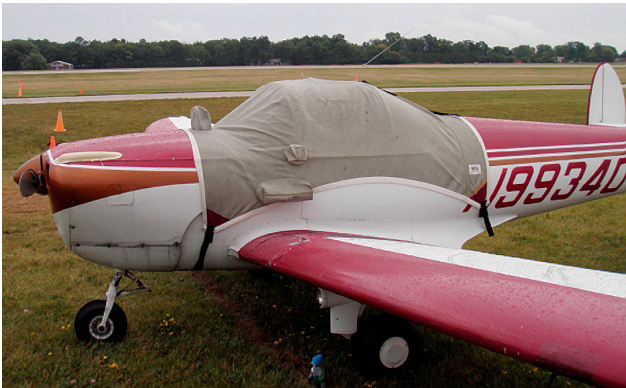
Ercoupe Canopy Cover, flat windshield model