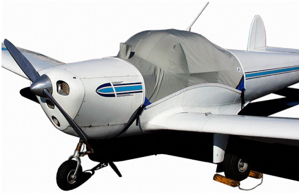
Ercoupe Canopy Cover, bubble windshield model

Travel Covers are made with Silver Solution-Dyed Polyester fabric and only lined over the windshield to save weight. The material is lightweight and more compact for easy stowage in the aircraft. The polyester material is water resistant, but only intended for occasional use outside. We also have an ultra lightweight material available for fitted hangar dust covers. For daily outdoor use, the non-travel Sunbrella Cover is the best choice.