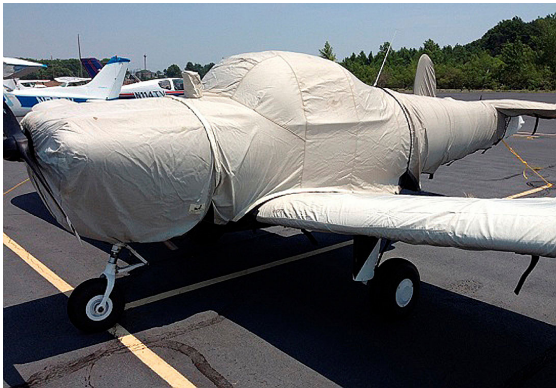
Ercoupe full cover set: Extended Canopy, Engine, Wing & Empennage covers

the Canopy Cover and Engine Cover. This cover will enclose the engine cowl and will extend aft to cover all of the windows. This cover type is made from Silver Acrylic Sunbrella canvas and is 100% lined with a soft and smooth microfiber. Bruce's Custom Covers developed this material combination especially for aircraft protection. The outer material is medium weight and treated for water resistance, UV resistance and anti-static buildup. The inner lining is a very soft and smooth microfiber to prevent scratching. The material is very reflective, and tests show that the cabin interior temperature can be reduced to near-ambient temperature on the hottest of days. It is water, ice and snow repellent, yet breathable to allow moisture to escape from between the cover and the aircraft surface.