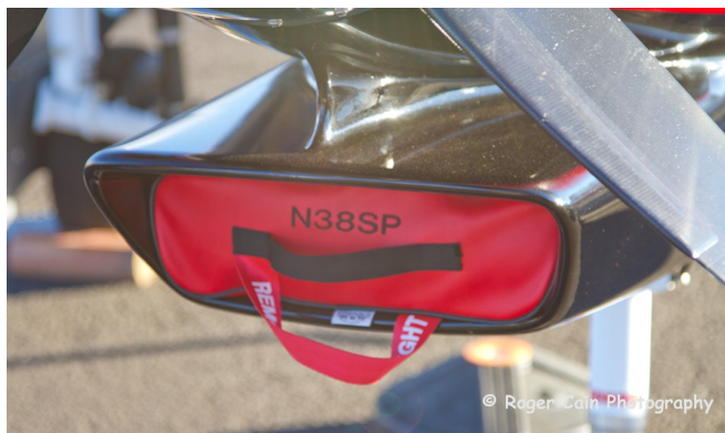
Lancair Evolution Engine Inlet Plug