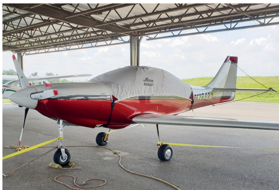
Lancair VI-P Canopy Cover & Engine Plugs

Engine Inlet Plugs are custom fit for your Lancair IV, LX7 intakes, made with heavy-duty vinyl material, and stuffed with a single block of sculpted urethane foam. Each plug has a zipper that allows the foam to be removed and dried if necessary. Engine plugs have warning flags that are visible from the cockpit or 'remove before flight' streamers sewn onto the face of the plugs. Most plugs are imprinted with the aircraft registration number in black for an extra charge. Storage bag NOT included. Engine plugs may be inserted after flight when the engine is still warm. Engine Inlet Plugs are commonly referred to as Cowl Plugs, Intake Plugs, Cowl Blocks, Engine Blocks, and Engine Bungs.