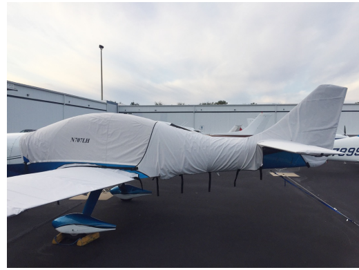
Lancair ES Wing Covers & Empennage Cover (sold separately)