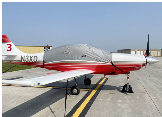
Lancair IV Travel Weight Canopy Cover

Travel Covers are made with Silver Solution-Dyed Polyester fabric and only lined over the windshield to save weight. The material is lightweight and more compact for easy stowage in the aircraft. The polyester material is water resistant, but only intended for occasional use outside. We also have an ultra lightweight material available for fitted hangar dust covers. For daily outdoor use, the non-travel Sunbrella Cover is the best choice.