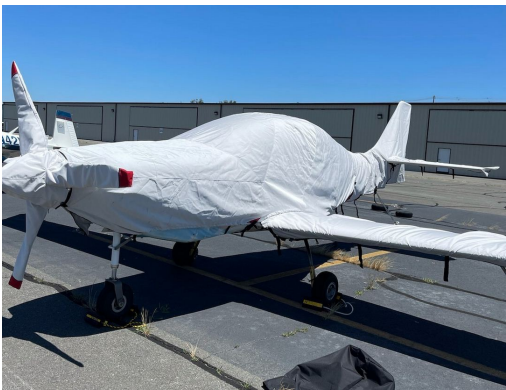
Lancair IV Complete Cover Set