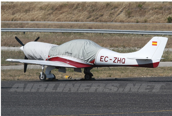
Lancair 360 Canopy Cover, Engine Cover

This cover type is made from Silver Acrylic Sunbrella canvas and is 100% lined with a soft and smooth microfiber. Bruce's Custom Covers developed this material combination especially for aircraft protection. The outer material is medium weight and treated for water resistance, UV resistance and anti-static buildup. The inner lining is a very soft and smooth microfiber to prevent scratching. The material is very reflective, and tests show that the cabin interior temperature can be reduced to near-ambient temperature on the hottest of days. It is water, ice and snow repellent, yet breathable to allow moisture to escape from between the cover and the aircraft surface.