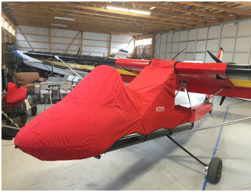
Lockwood AirCam Canopy/Nose Cover w/ aft baggage compartment extension