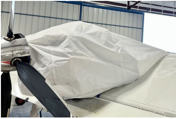
Lockwood Air Cam Engine Cover, test fit cover