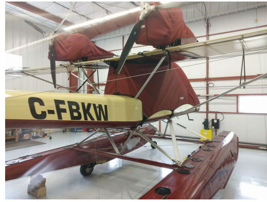
Lockwood Aircam Canopy Cover (fully enclosed bubble), Engine Covers