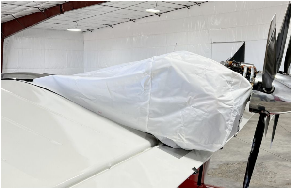
Lockwood Air Cam Engine Cover, test fit cover