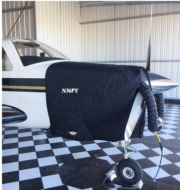
Beech Bonanza 36 Models Insulated Engine Cover