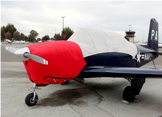
T-34A Insulated Engine Cover

This cover type is made from Silver Acrylic Sunbrella canvas and is 100% lined with a soft and smooth microfiber. Bruce's Custom Covers developed this material combination especially for aircraft protection. The outer material is medium weight and treated for water resistance, UV resistance and anti-static buildup. The inner lining is a very soft and smooth microfiber to prevent scratching. The material is very reflective, and tests show that the cabin interior temperature can be reduced to near-ambient temperature on the hottest of days. It is water, ice and snow repellent, yet breathable to allow moisture to escape from between the cover and the aircraft surface.