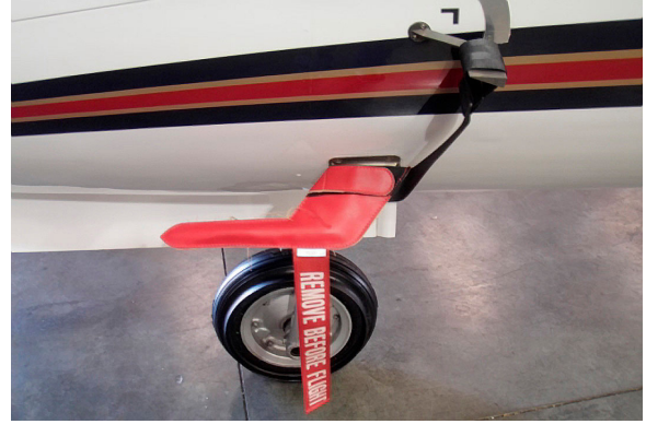
Learjet Heat Resistant Pitot Cover and AOA Strap