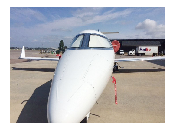
Lear Models 40 & 45 Cockpit Heatshields, Covers All Cockpit Windows

Cockpit Heatshields are interior sunshades for the aircraft's cockpit. The product is a unique composite of closed-cell foam with a silver mylar finish. The semi-rigid design is stiff enough to stand inside the window framing. The set folds up flat and is easily stored in the included storage sleeve. Some designs may require velcro and suction cups. Our Heatshields for jets are offered white side out because some aircraft manufacturers have issued advisories against reflective window inserts due to potential heat damage. A Heatshield is an excellent short-term remedy for cockpit overheating, but an external fabric cover is more effective for long-term protection.