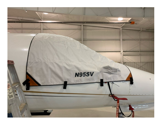
Lear 70 Cockpit Cover