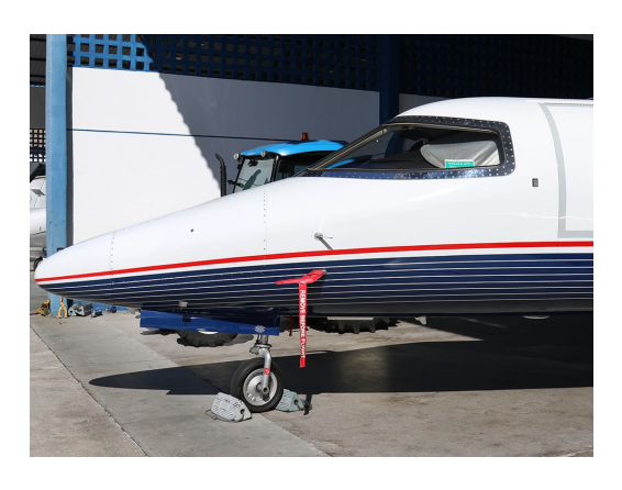
Lear Pitot Covers