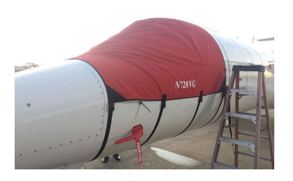
Learjet 45 Cockpit Cover