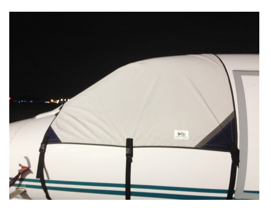
Lear 31 Cockpit Cover