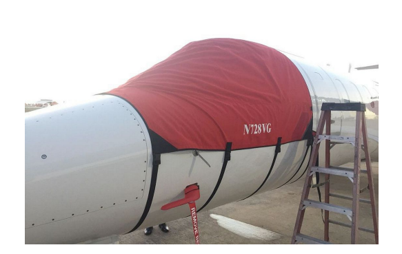
Learjet 45 Cockpit Cover

This cover type is made from Silver Acrylic Sunbrella canvas and is 100% lined with a soft and smooth microfiber. Bruce's Custom Covers developed this material combination especially for aircraft protection. The outer material is medium weight and treated for water resistance, UV resistance and anti-static buildup. The inner lining is a very soft and smooth microfiber to prevent scratching. The material is very reflective, and tests show that the cabin interior temperature can be reduced to near-ambient temperature on the hottest of days. It is water, ice and snow repellent, yet breathable to allow moisture to escape from between the cover and the aircraft surface.