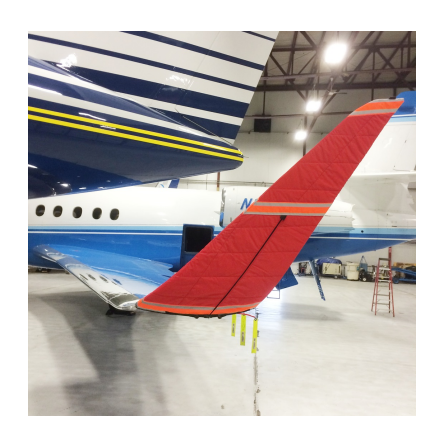
Falcon 2000 Winglet Pad