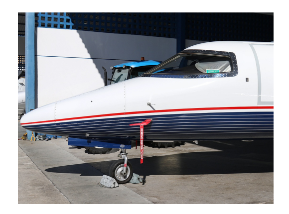
Lear Pitot Cover