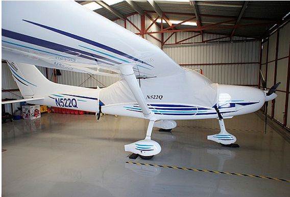
TL Ultralight Sirius Canopy Cover

This cover type is made from Silver Acrylic Sunbrella canvas and is 100% lined with a soft and smooth microfiber. Bruce's Custom Covers developed this material combination especially for aircraft protection. The outer material is medium weight and treated for water resistance, UV resistance and anti-static buildup. The inner lining is a very soft and smooth microfiber to prevent scratching. The material is very reflective, and tests show that the cabin interior temperature can be reduced to near-ambient temperature on the hottest of days. It is water, ice and snow repellent, yet breathable to allow moisture to escape from between the cover and the aircraft surface.