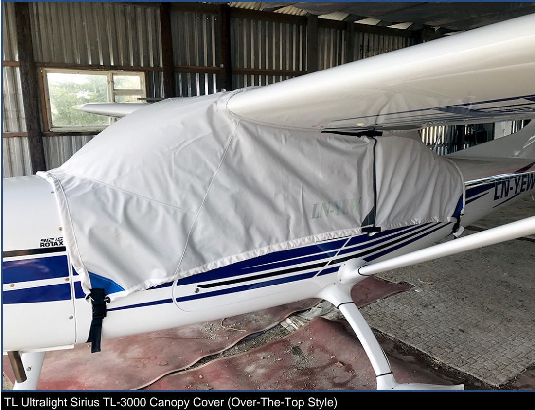
TL Ultralight Sirius TL-3000 Canopy Cover (Over-The-Top Style)