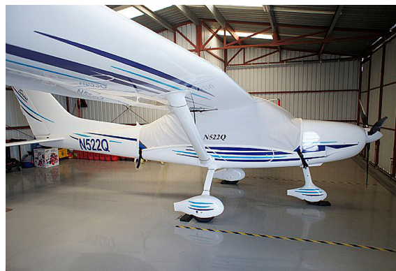
TL Ultralight Sirius Canopy Cover