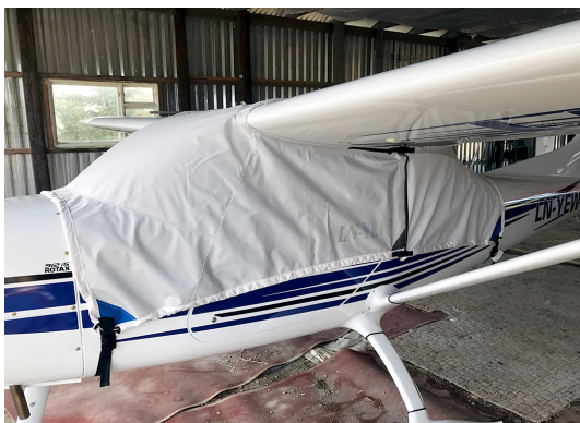
TL Ultralight Sirius TL-3000 Canopy Cover (Over-The-Top Style)

This cover type is made from Silver Acrylic Sunbrella canvas and is 100% lined with a soft and smooth microfiber. Bruce's Custom Covers developed this material combination especially for aircraft protection. The outer material is medium weight and treated for water resistance, UV resistance and anti-static buildup. The inner lining is a very soft and smooth microfiber to prevent scratching. The material is very reflective, and tests show that the cabin interior temperature can be reduced to near-ambient temperature on the hottest of days. It is water, ice and snow repellent, yet breathable to allow moisture to escape from between the cover and the aircraft surface.