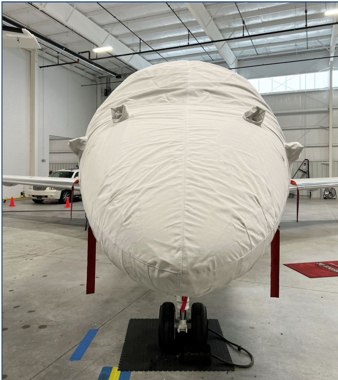
Embraer Legacy 500, (EMB-550) Cockpit/Nose Cover