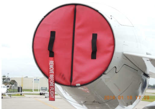
Embraer Legacy 500 Engine Exhaust Plug, folding type

The Engine Inlet Plugs are custom fit for your Embraer Legacy 500 Praetor, (EMB-545/550) intakes, made with heavy-duty vinyl material, and stuffed with a single block of sculpted urethane foam. Each plug has a zipper that allows the foam to be removed and dried if necessary. Engine plugs have 'remove before flight' streamers sewn onto the face of the plugs. Most plugs are imprinted with the aircraft registration number in black for an extra charge. Storage bag NOT included. Engine plugs may be inserted after flight when the engine is still warm. Engine Inlet Plugs are commonly referred to as Cowl Plugs, Intake Plugs, Cowl Blocks, Engine Blocks, and Engine Bungs.