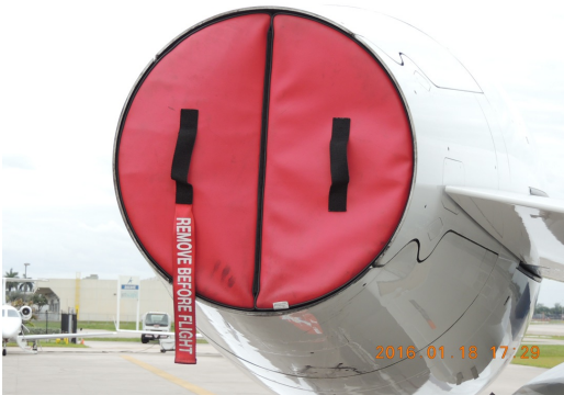
Embraer Legacy 500 Engine Exhaust Plug, folding type

The Engine Inlet Plugs are custom fit for your Embraer Legacy 500 Praetor, (EMB-545/550) intakes, made with heavy-duty vinyl material, and stuffed with a single block of sculpted urethane foam. Each plug has a zipper that allows the foam to be removed and dried if necessary. Engine plugs have 'remove before flight' streamers sewn onto the face of the plugs. Most plugs are imprinted with the aircraft registration number in black for an extra charge. Storage bag NOT included. Engine plugs may be inserted after flight when the engine is still warm. Engine Inlet Plugs are commonly referred to as Cowl Plugs, Intake Plugs, Cowl Blocks, Engine Blocks, and Engine Bungs.