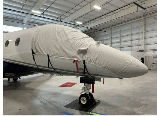
Embraer Legacy 500, (EMB-550) Cockpit/Nose Cover