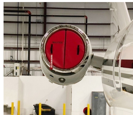
Embraer Legacy 500 Engine Inlet Plugs, folding type