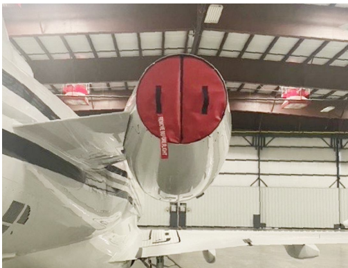
Embraer Legacy 500 Engine Exhaust Plugs, folding type

The Engine Inlet Plugs are custom fit for your Embraer Legacy 500 Praetor, (EMB-545/550) intakes, made with heavy-duty vinyl material, and stuffed with a single block of sculpted urethane foam. Each plug has a zipper that allows the foam to be removed and dried if necessary. Engine plugs have 'remove before flight' streamers sewn onto the face of the plugs. Most plugs are imprinted with the aircraft registration number in black for an extra charge. Storage bag NOT included. Engine plugs may be inserted after flight when the engine is still warm. Engine Inlet Plugs are commonly referred to as Cowl Plugs, Intake Plugs, Cowl Blocks, Engine Blocks, and Engine Bungs.