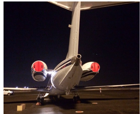
Embraer Legacy Exhaust Plugs